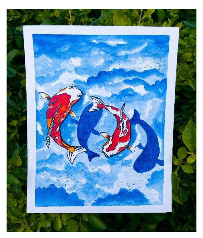
The 2<sup>nd</sup> Place winning Painting