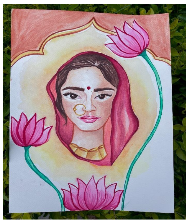
The 1st Place winning Painting

2<sup>nd</sup> Place: Muskan (1MJ20IS054) 3<sup>rd</sup> Place: Charan HS (1MJ19IS023)