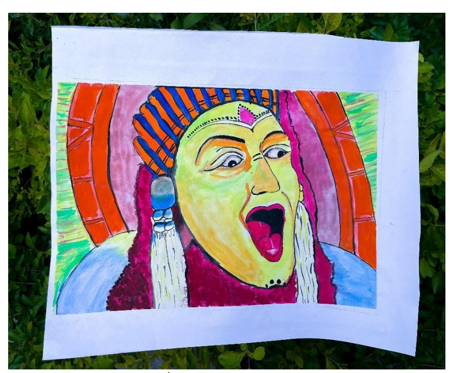
The 3<sup>rd</sup> Place winning Painting