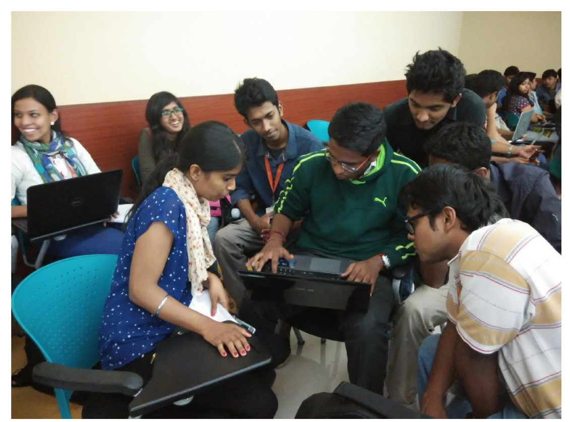
CISCO trainers interacting with students, clearing their doubts.