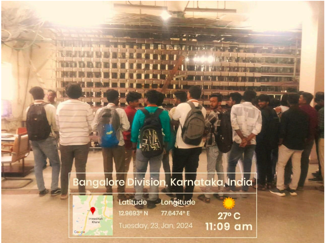
Third year ECE students attentively listening to the concept of main distribution function