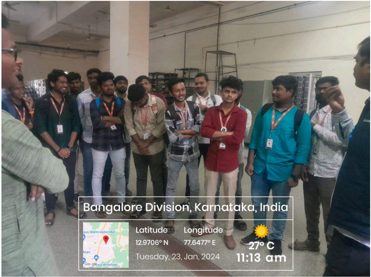
Third year ECE students inside the DDTC BSNL, Bangalore