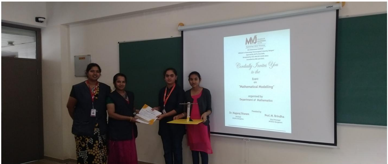
Students are receiving the prize during the "MATLITE" club event " MATHEMATICAL MODELING " organized by Department of Mathematics, MVJCE at ROOM No.324 on 21 st September 2019.