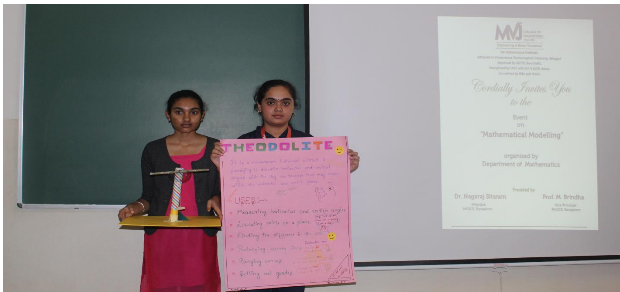
Students with their model during the "MATLITE" club event "MATHEMATICAL MODELING" organized by Department of Mathematics, MVJCE at ROOM No.324 on 21 st September 2019.