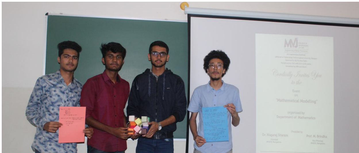
Students with their model during the "MATLITE" club event "MATHEMATICAL MODELING" organized by Department of Mathematics, MVJCE at ROOM No.324 on 21 st September 2019.