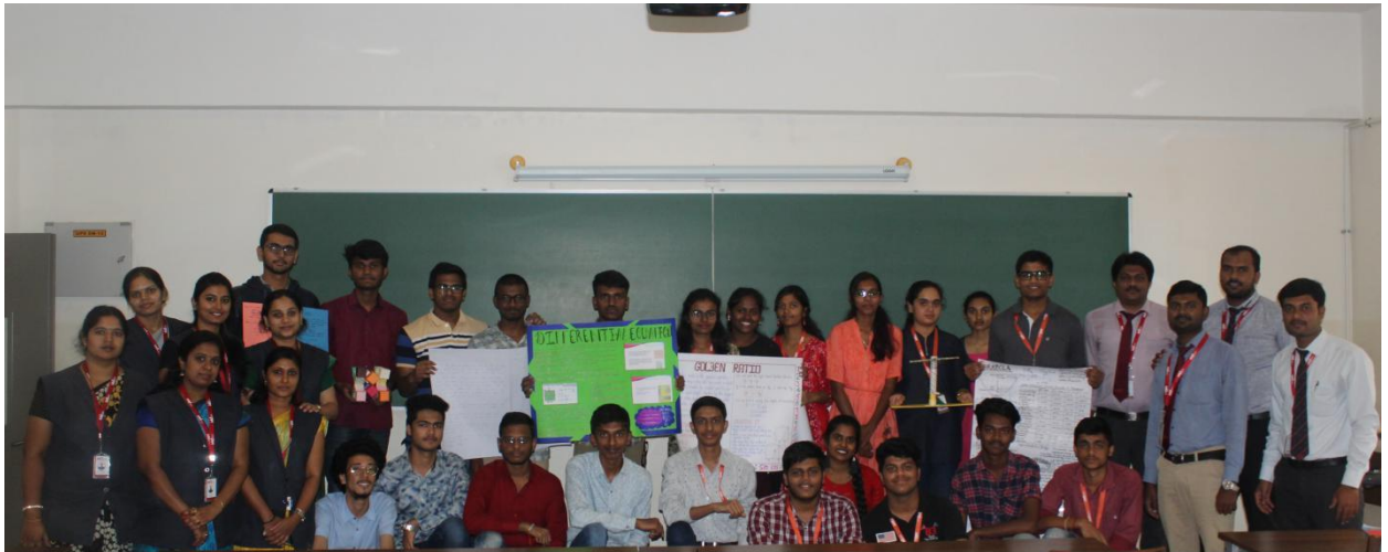
Faculty and Students with their models during the "MATLITE" club event " MATHEMATICAL MODELING " organized by Department of Mathematics, MVJCE at ROOM No.324 on 21 st September 2019.