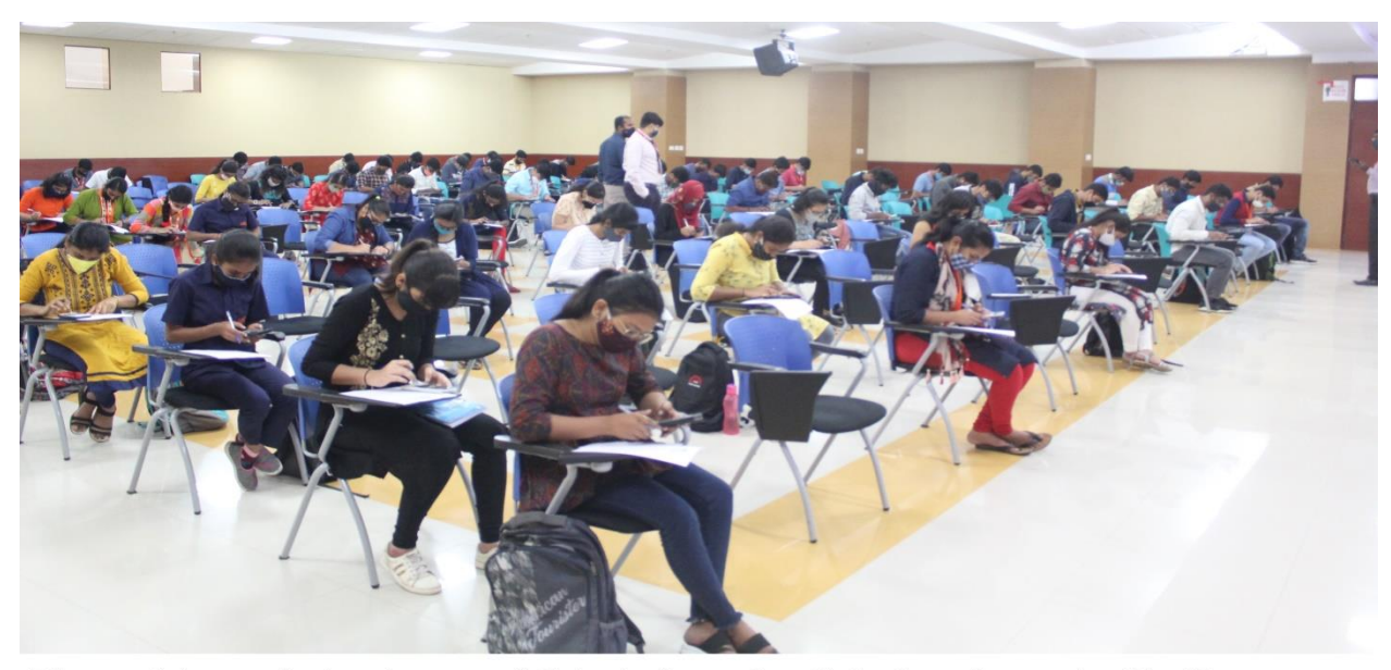
The participants during the event "Calculation using Calculator" organized by Department of Mathematics, MVJCE at Rajalakshmi seminar hall on 13th March 2021.