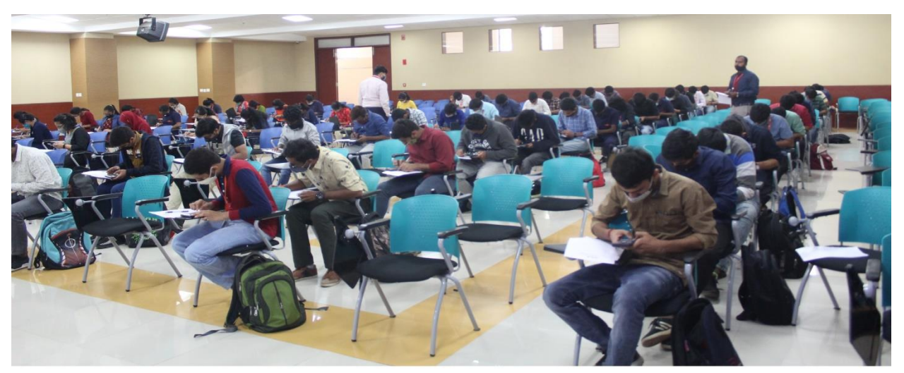
The participants during the event "Calculation using Calculator" organized by Department of Mathematics, MVJCE at Rajalakshmi seminar hall on 13th March 2021.

The event comprising two rounds (Qualifying round and Final round) started at 8.30 am, in Rajalakshmi Seminar Hall. In the qualifying round, around 100 students from different disciplines of First year Engineering participated. Out of these, 26 students were selected for the final round.