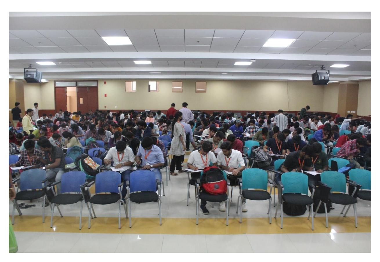
Students during the 'Preliminary Round' of the MATLITE Club Activity 'Math Mastery'.

The Final Round was conducted at M V Jayaraman Auditorium. In this Round, the participants had to solve 10 pictorial logical questions based on Higher Mathematics – questions on Matrices, decoding, guessing the famous mathematician and so on.