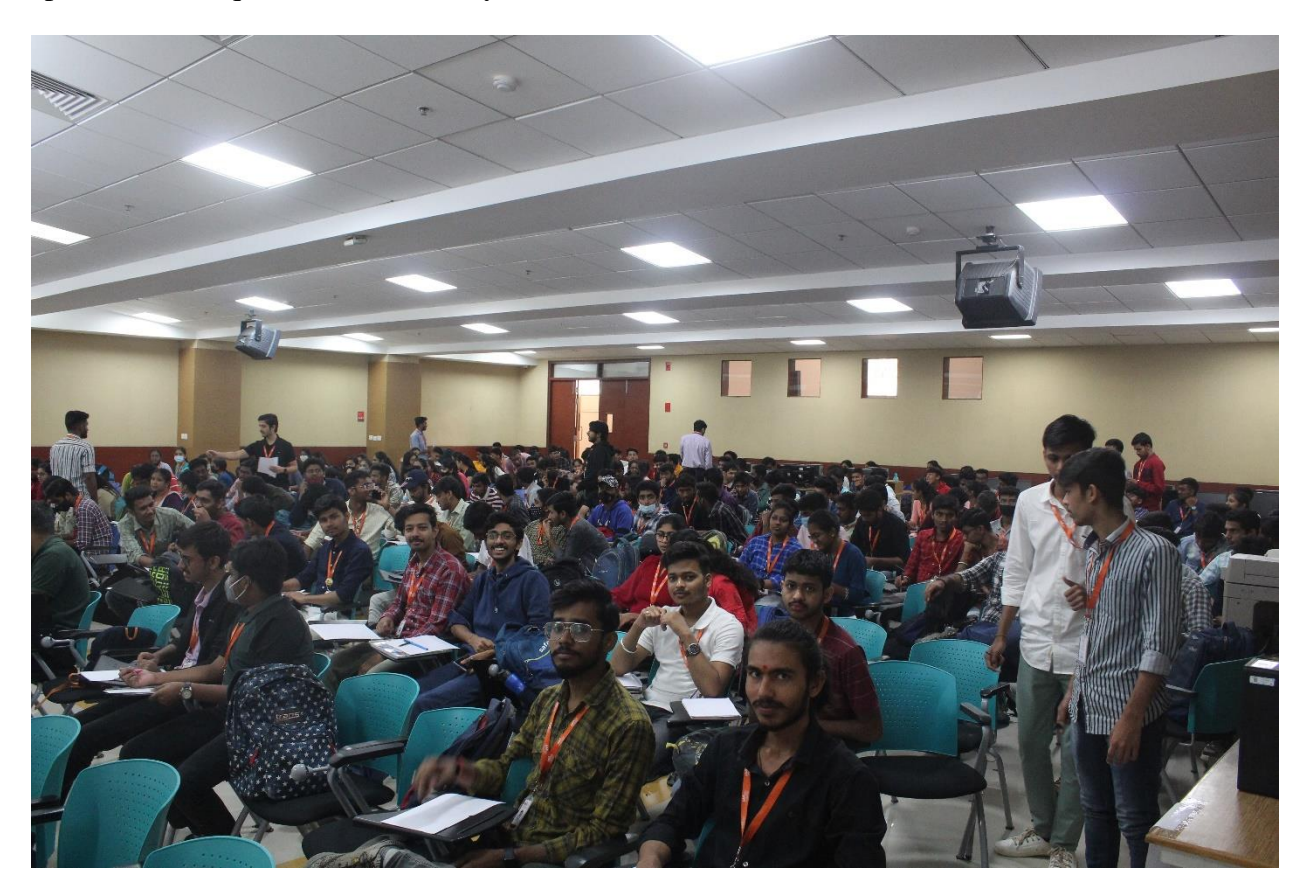
Students actively participating in the MATLITE Club Activity 'Math Mastery'.

The activity comprised of two Rounds, Preliminary and Final Rounds. The main aim of this Club activity was to make sure that the students would use their basic Mathematical logic, to solve aptitude-based questions, effectively.