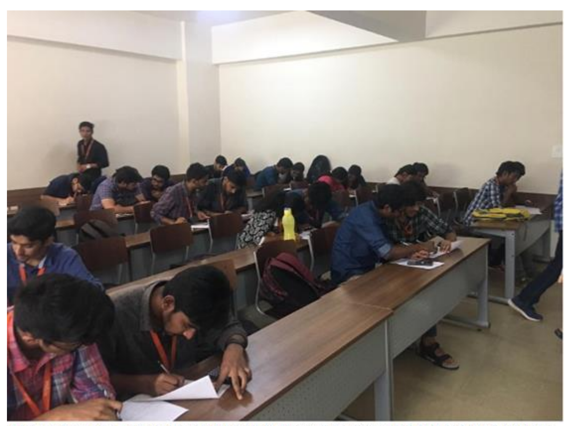
NIC club event "Techtonic" organized by CSE Department: Students of Pre-final year and second year are busy solving the Round 1 of the event at room no 251 in CSE department, for qualifying to the Round 2 of the event held on 27<sup>th</sup> March 2019.