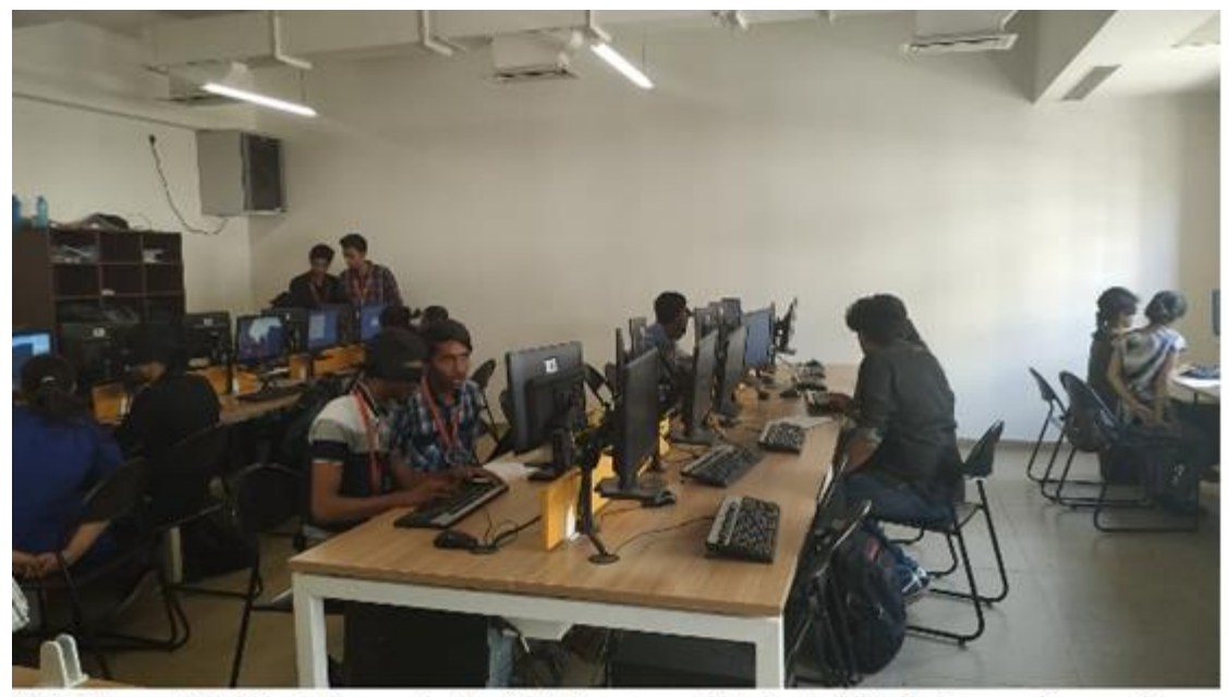
NIC club event "Techtonic" organized by CSE Department: Students of Pre-final year and second year are busy trying to solve the given problem in Round 2 of the event on 27th March 2019.