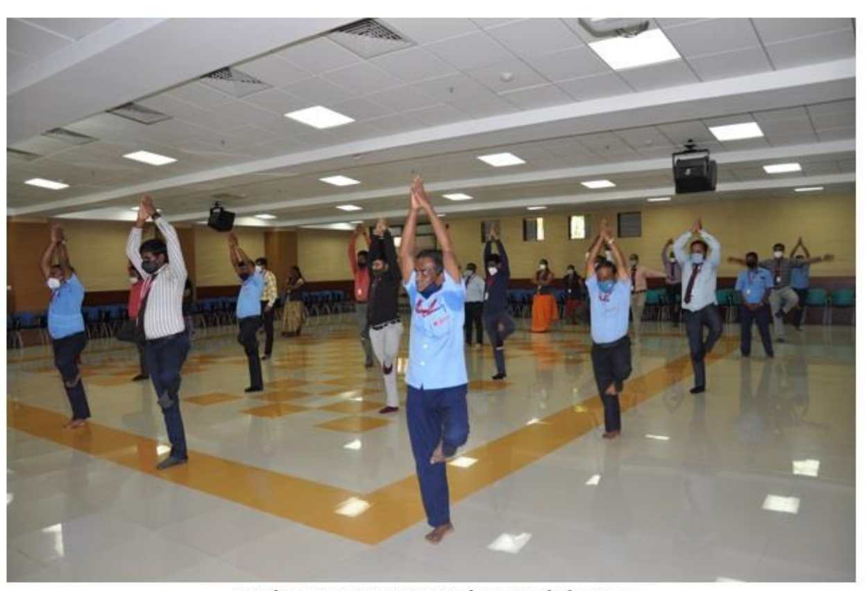
Faculties participating in doing Vrikshasana