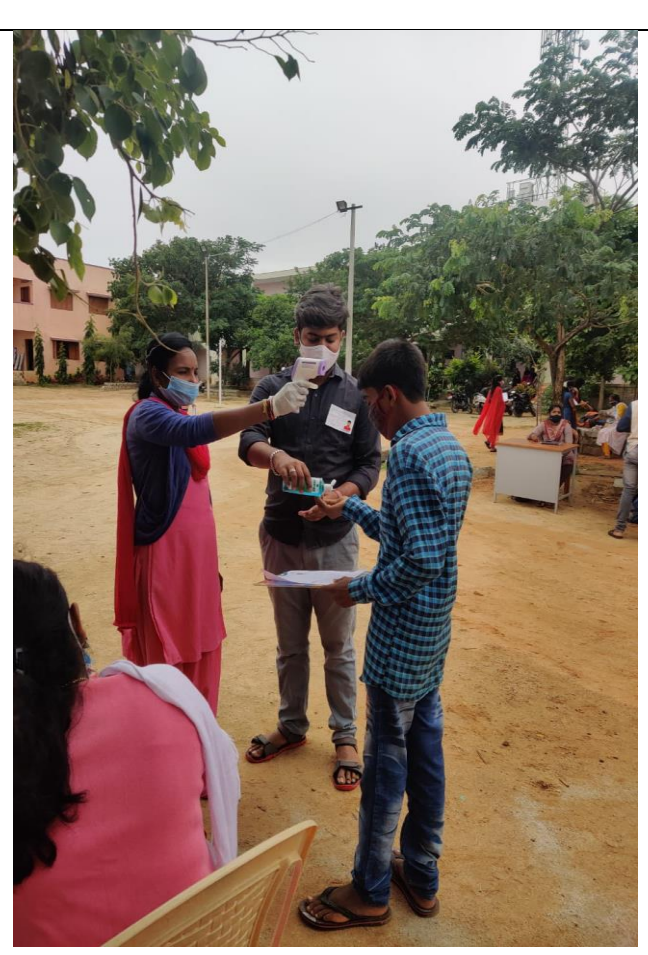
Govt Girls High School, Bagepalli