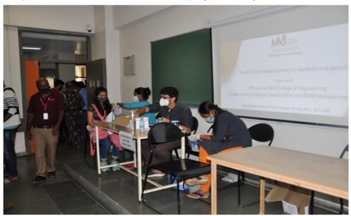
COVAXIN Vaccination for Students

The vaccination drive was successfully organized, On 2nd July 2021 we have covered 285 persons in giving Covaxin and on 3rd July 2021 we are successful in covering 325 persons (305 Covishield & 20 Covaxin). Principal has conveyed his thanks to everyone who have extended cooperation and support for successful completion of vaccination drive and special thanks to all BBMP officials and District Health Officer, Bangalore for their wonderful support extended in organizing this drive in our campus. The BBMP officials given words to conduct one more drive in our campus after 30 days for the persons who have taken as first dose of vaccination. Further MVJCE has given instructions to all faculty, staff and students vaccinated before they report to college.