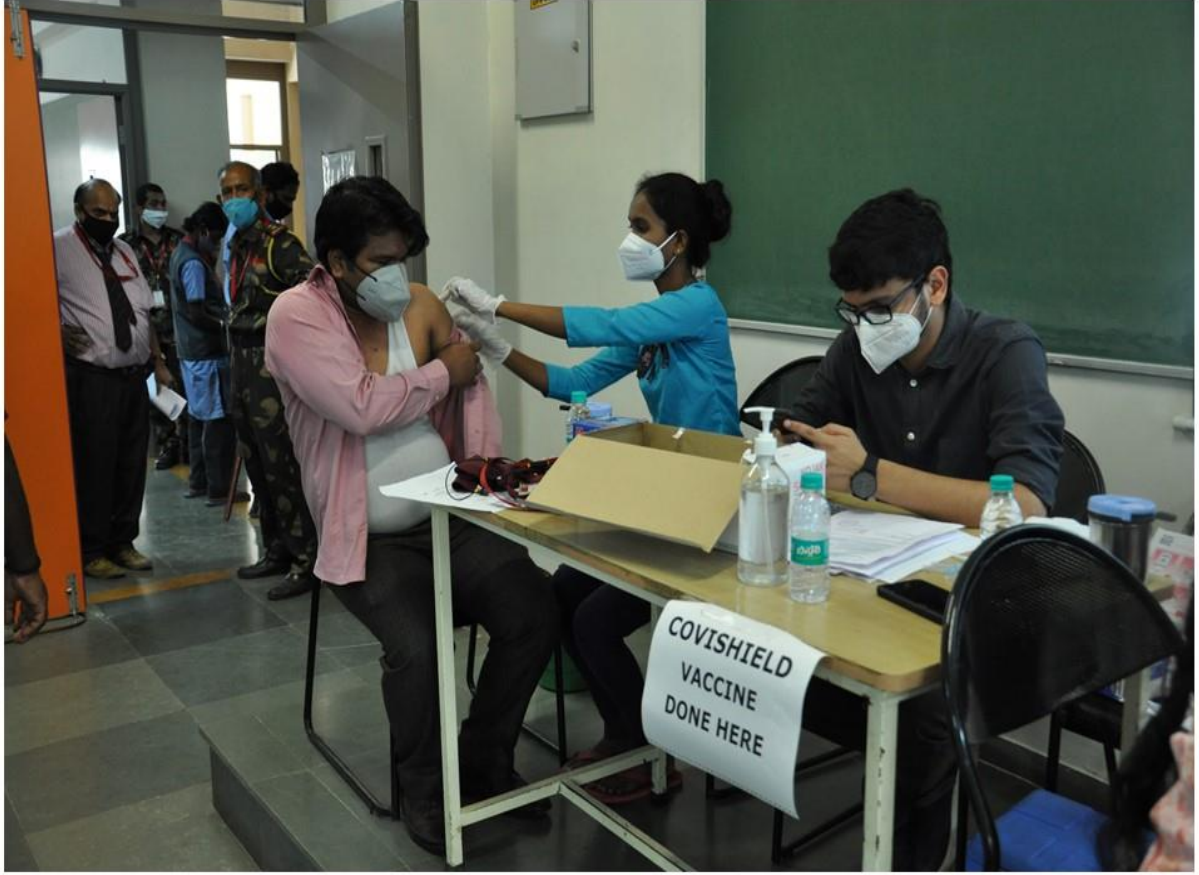
COVISHIELD Vaccination for Faculties