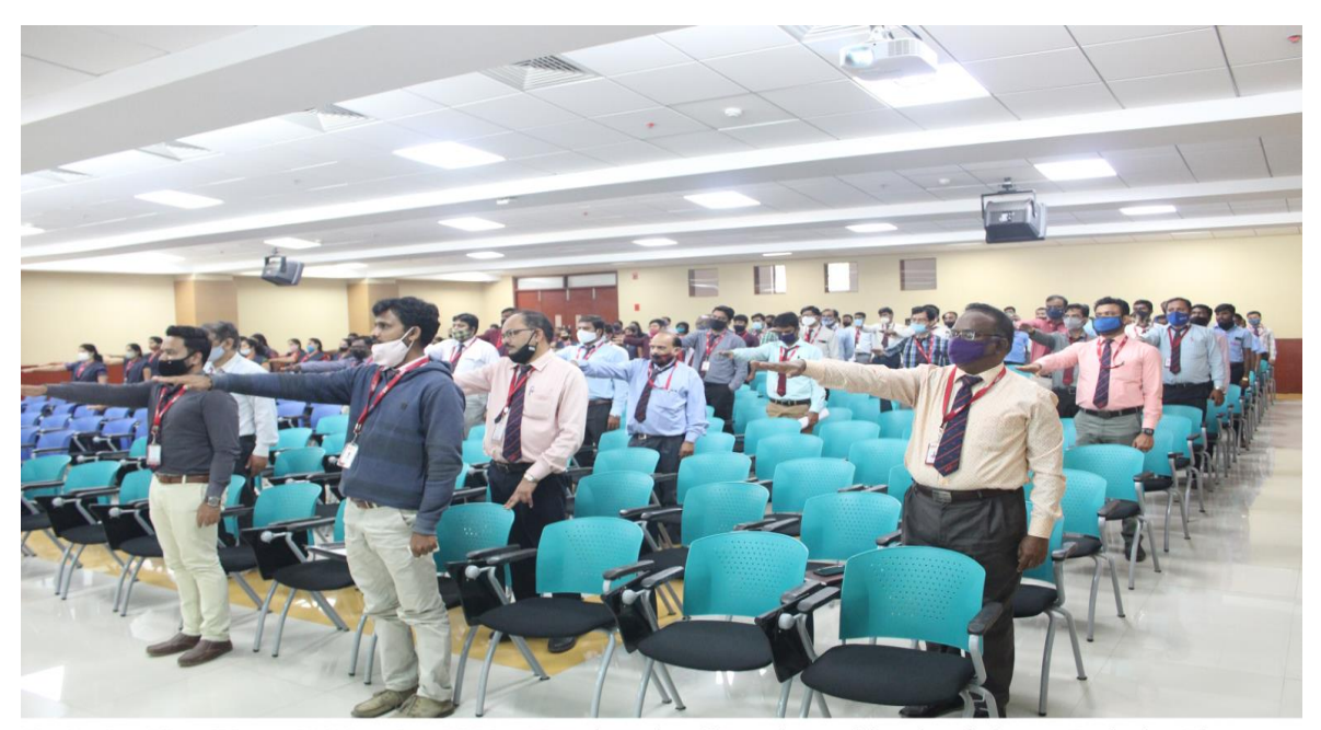
Rashtriya Ekta Diwas Celebration 2020: - Facutly and staff members taking the pledge on Rashtriya Ekta Diwas on 02nd November 2020 in Smt. Rajalakshmi seminar hall, MVJCE.