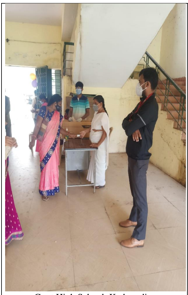
Govt High School, Kadugudi

As a government of Karnataka dept of primary and secondary education was decided to conduct the SSLC examination on 19 & 22 of July 2021. Due to shortage of staff the Youth for seva (NGO) collaborating with VTU Belgaum to provide the NSS students for all constituent and affiliated colleges of VTU for the SSLC examination duty as a Crowd maintenance & Covid 19 screening. Implementing the SOP'S was difficult as the number of students was large in count with the collaboration of ground staff & police it took a while to implement SOP'S successfully. As we enquire with the examination centre in charge & Nodal officer we got to know that strength of student in Govt high school, Kadugodi was 220, Govt Girls High School, Bagepalli was 310. We implemented all the SOP'S to all students successfully & we directed them to their respective room number of examination to be held.