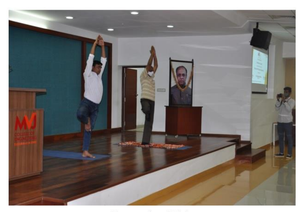
Demonstration of Vrikshasana