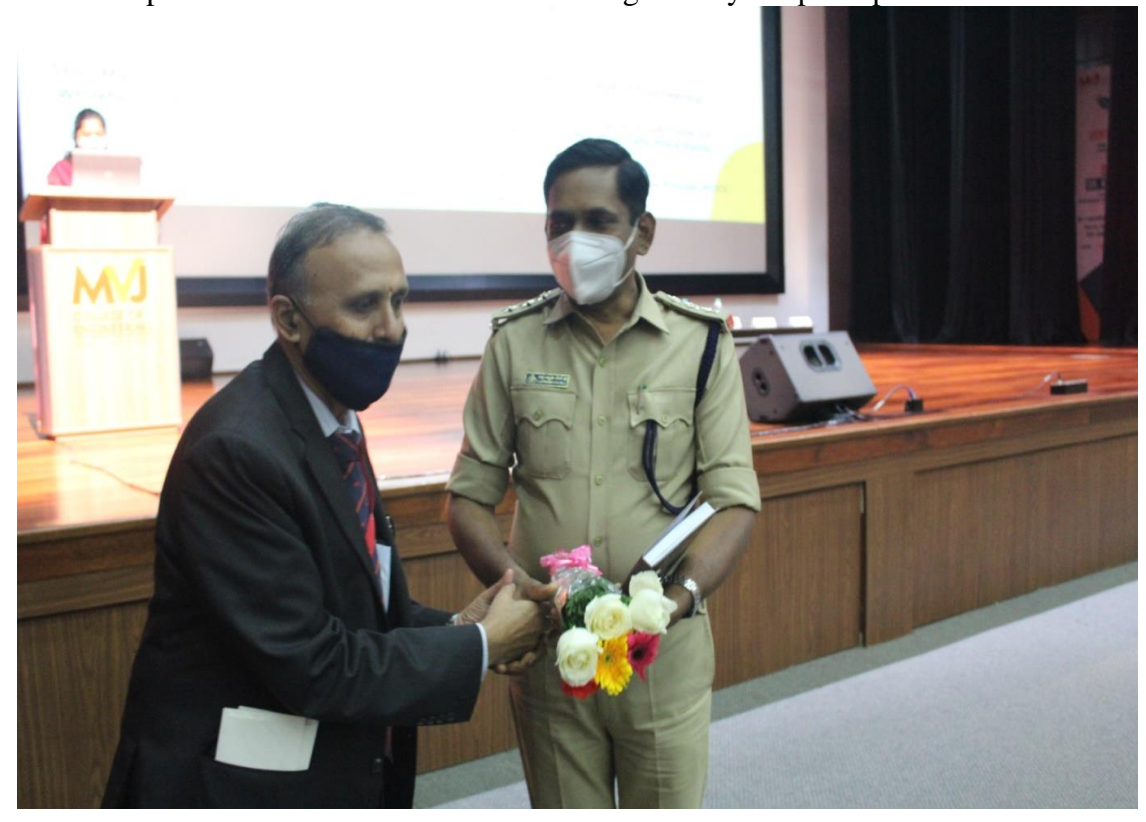
~~~ "Safe yourself to save your family" ~~~~