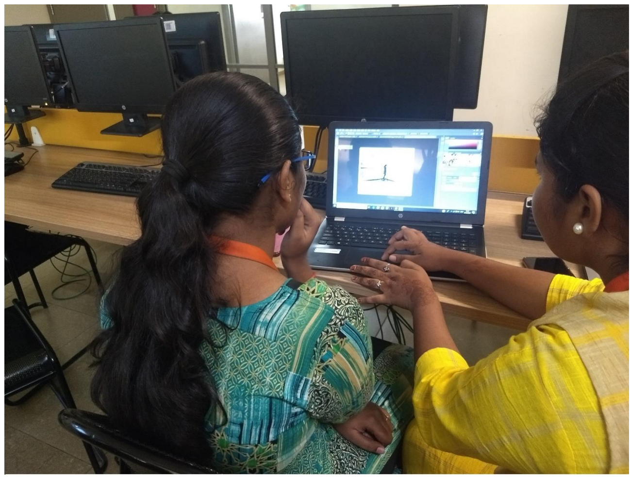
"WORKSHOP ON ANIMATION TOOLS" , 13<sup>th</sup> May 2019, Organized by Department of CSE, Venue: CSE Lab 255. Participants as a team, working on newsletter design in the morning session.

After the tea break, the session started with an activity. The participants were given a theme on designing a college newsletter, after a discussion on the photoshop basics that are needed to start any design. The participants learnt about design thinking, and how to apply design thinking in a given project. They were also encouraged on using their creativity, and add features to their design.