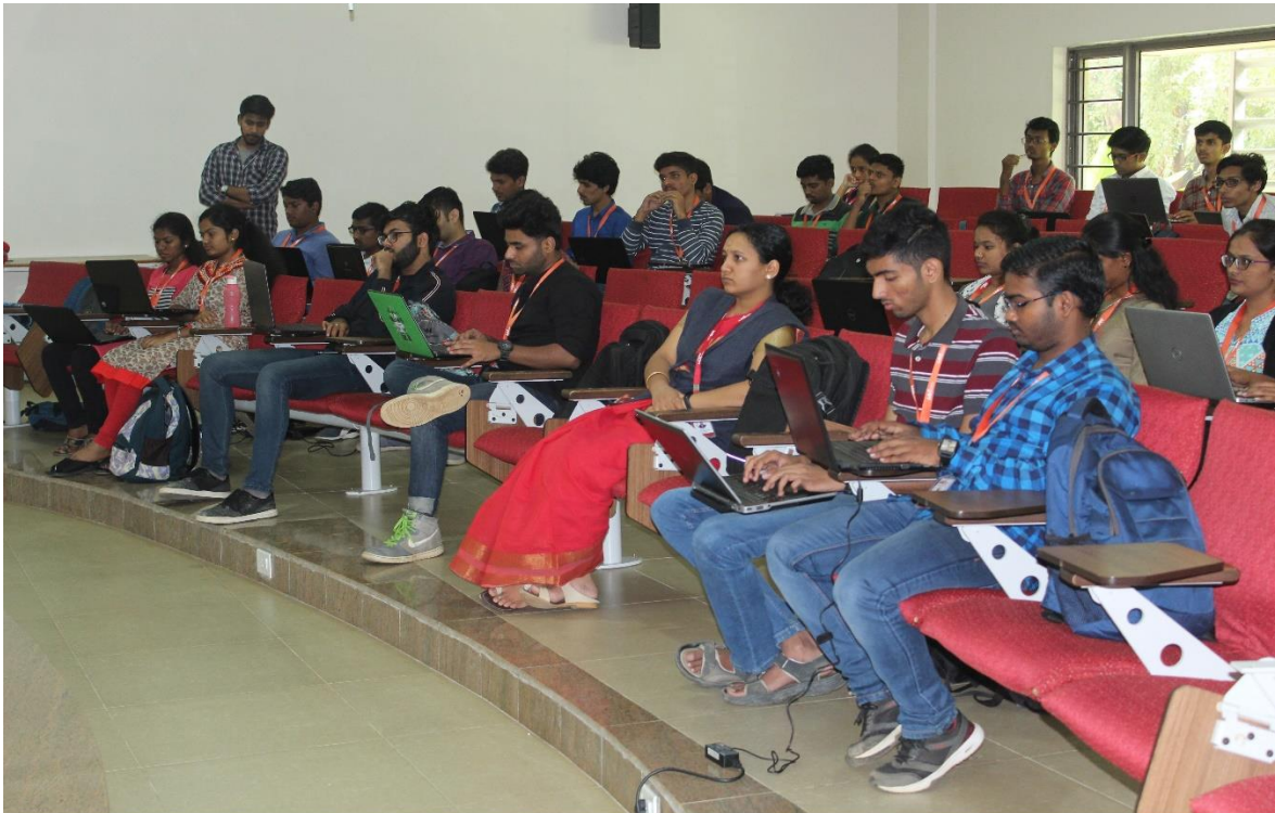
Student participants in the “2 day Workshop on PHP” conducted by Software Development Club, CSE department on 20.09.2019 and 21.09.2019 in Seminar Hall 4,MVJCE.