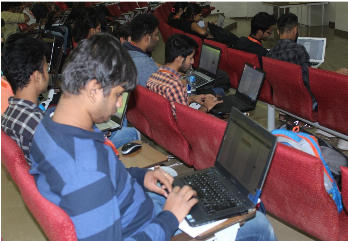
Student participants in the “2 day Workshop on AdobeXD” conducted by Software Development Club, CSE department on 20.09.2019 and 21.09.2019 in Seminar Hall 5,MVJCE.