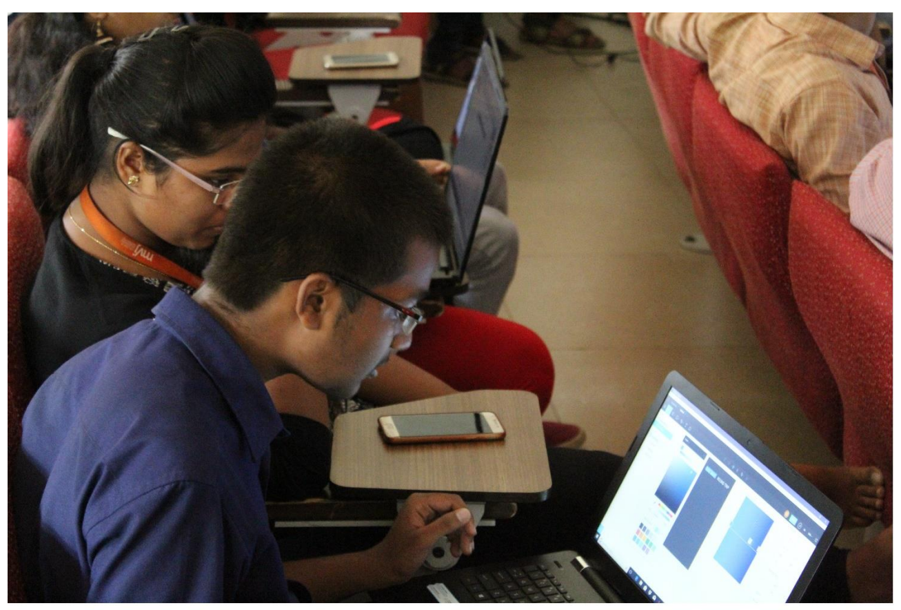
Student participants creating the flight booking app at the "Workshop on UI/UX Design" conducted by Software Development Club from 14<sup>th</sup> May 2018 to 15<sup>th</sup> May 2018.