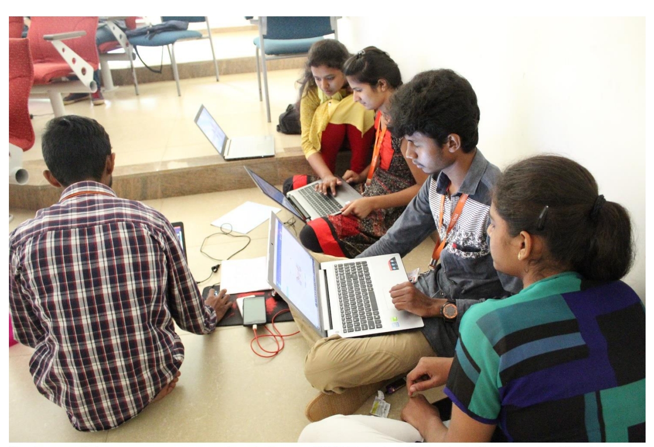
Student participants as a team creating their own UI/UX design for a given theme at the "Workshop on UI/UX Design "conducted by Software Development Club from 14<sup>th</sup> May 2018 to 15<sup>th</sup> May 2018.