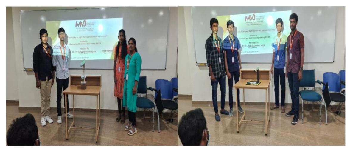
Spark club activity on "Light the Road with Renewable Energy" organized by the department of EEE, MVJCE on 9th November 2021: 2nd Prize Winners