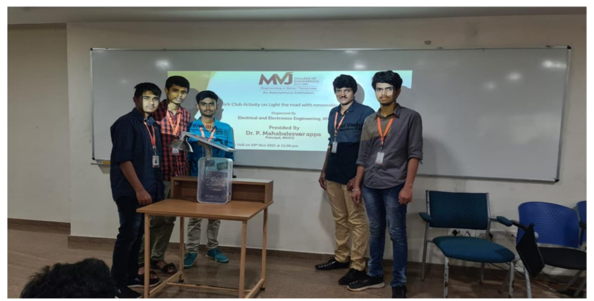
Spark club activity on "Light the Road with Renewable Energy" organized by the department of EEE, MVJCE on 9th November 2021: 1st Prize Winners