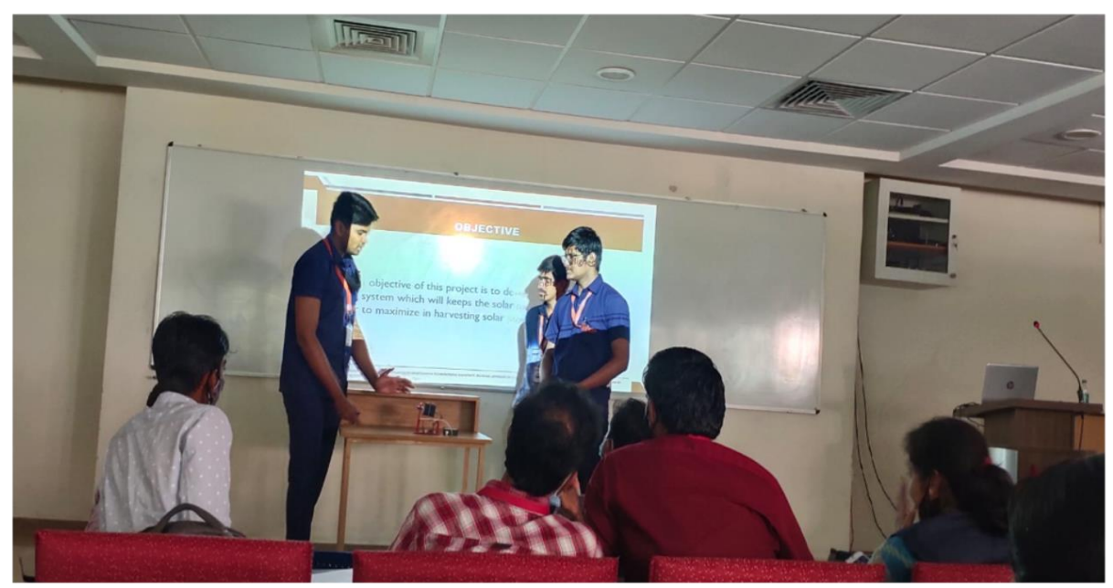
Spark club activity on "Light the Road with Renewable Energy" organized by the department of EEE, MVJCE on 9th November 2021: Participants demonstrating their models