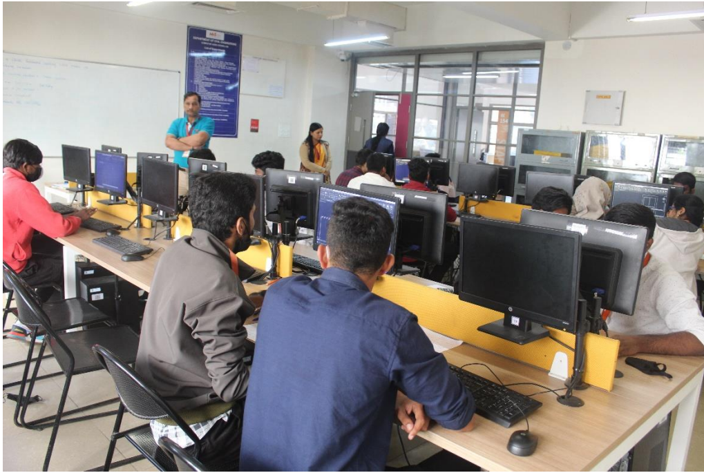
Students from 3 rd semester, Civil Engineering Department planning and plotting a residential building