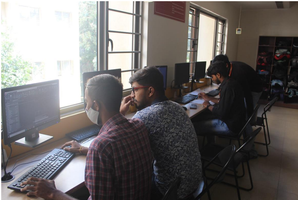
Students from 3 rd semester, Civil Engineering Department planning and plotting a residential building