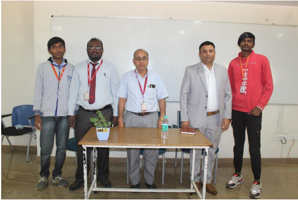
1 st Prize Winners of the Club Activity 'CAD PLOT'