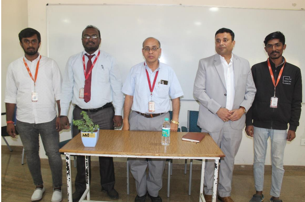
2 nd Prize Winners of the Club Activity 'CAD PLOT'