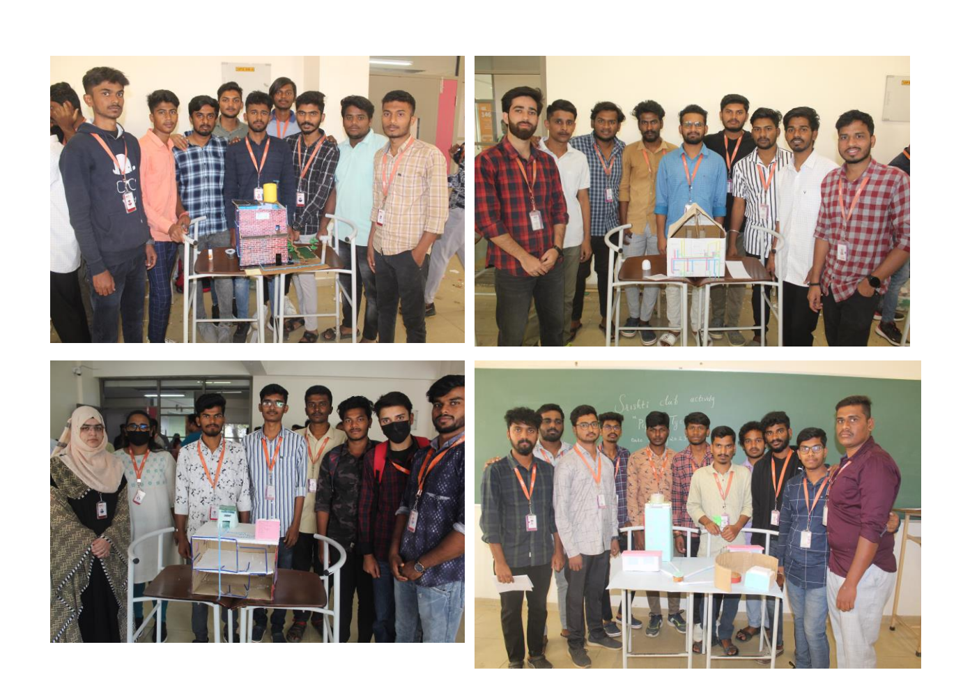
Students from Civil Engineering Department with their Pipeline Models for Residential Buildings