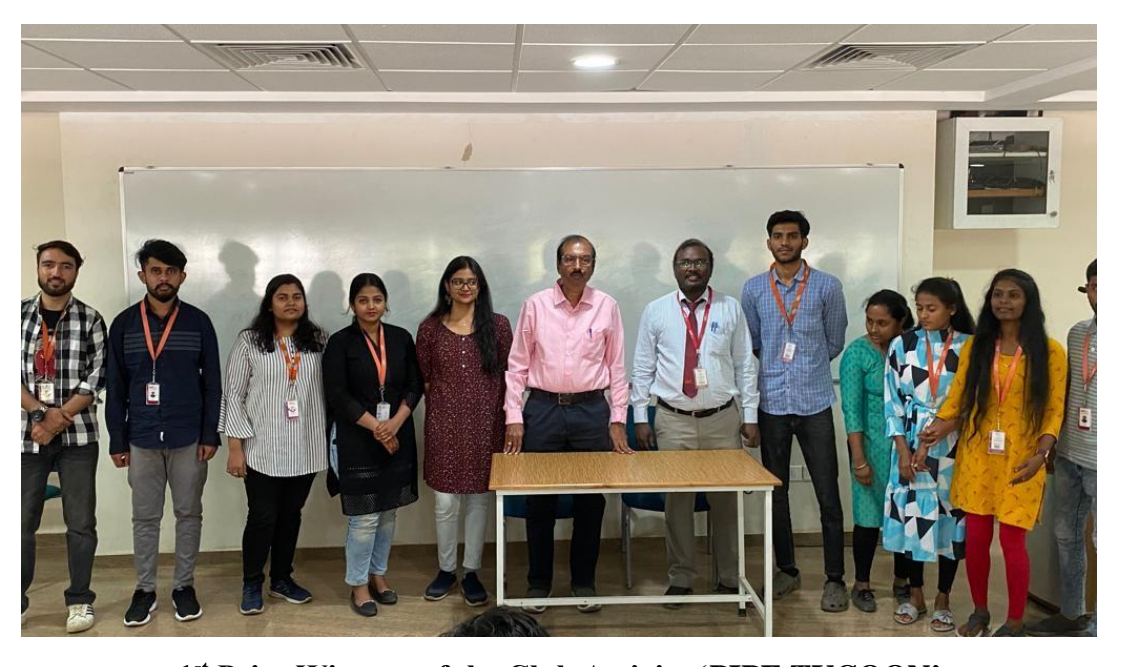
1st Prize Winners of the Club Activity 'PIPE TYCOON'