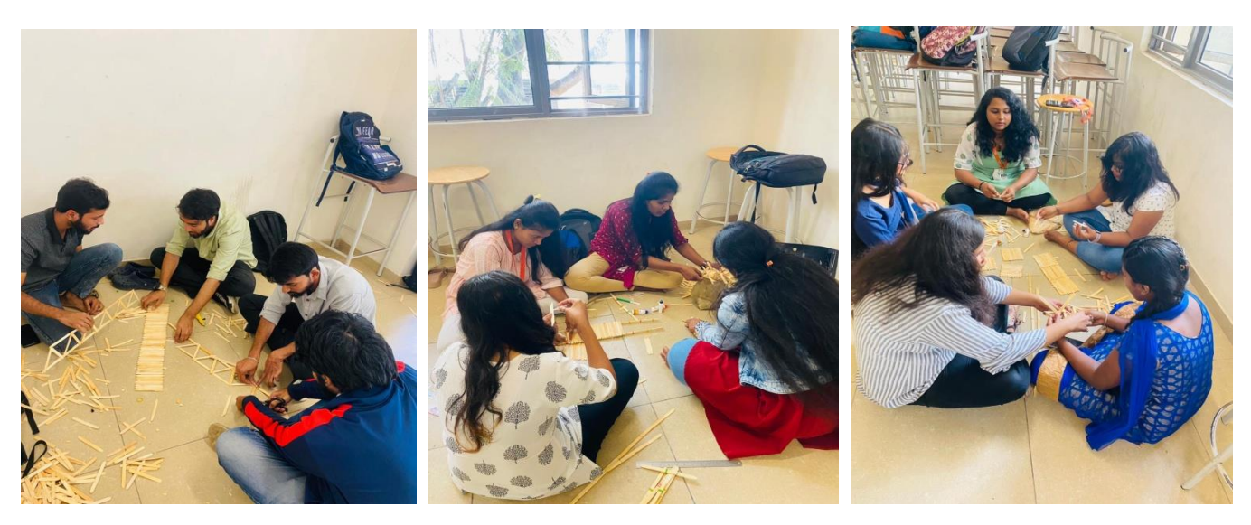
Involvement of students in Bridge-Model making