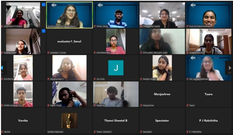
Pic: Students taking part in the 90 th Meeting