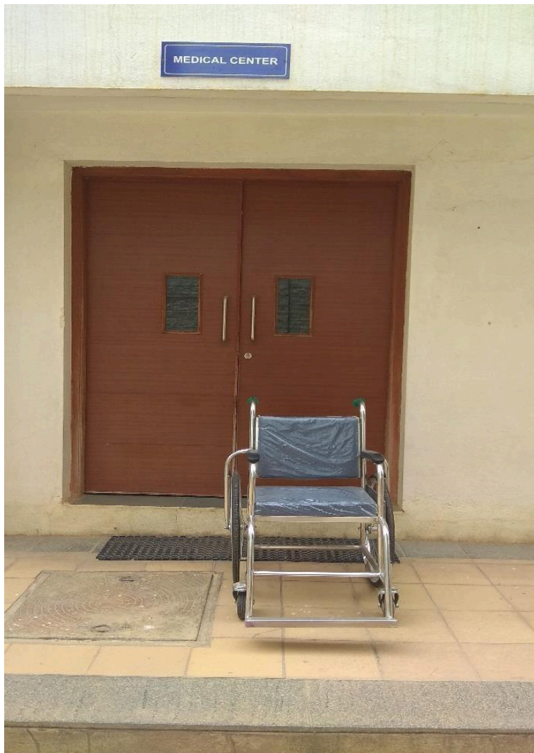
Wheel chair facility

The college provides special facilities for the differently abled students and persons to provide them opportunities to acquire quality education and to bring them into the main stream of the society. The college has a social responsibility and perception that differently abled students should be respected and treated as a normal human being.