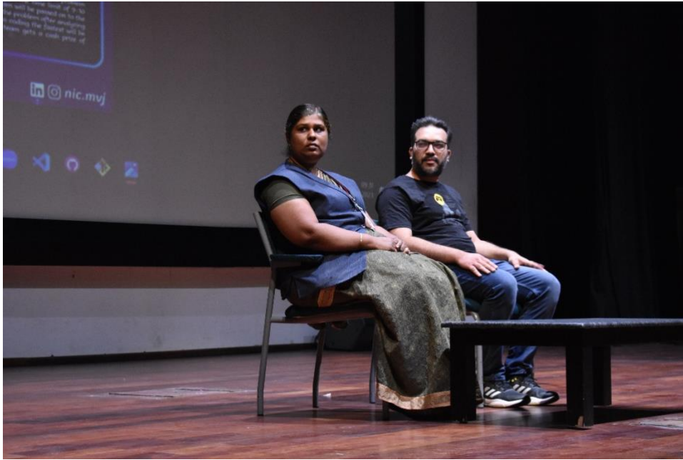
Round 2: The Final Round