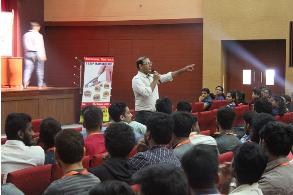
Career counselling workshop for pre final year students on November 14th 2019 in MVJ Auditorium organized by CSE Department

The students were motivated to start preparing for the above competitive exams ahead of time, so that they can score well to enable them to get into reputed institutions, for a bright future.