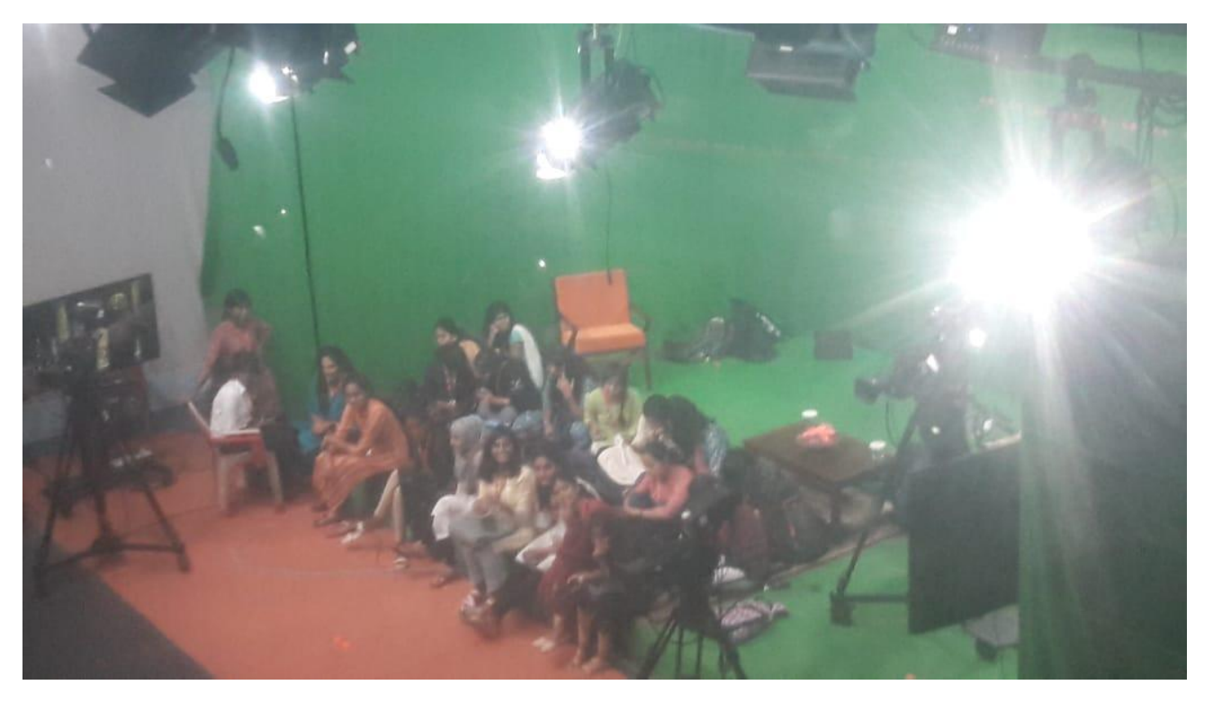
Live studio inside the Doordarshan Kendra