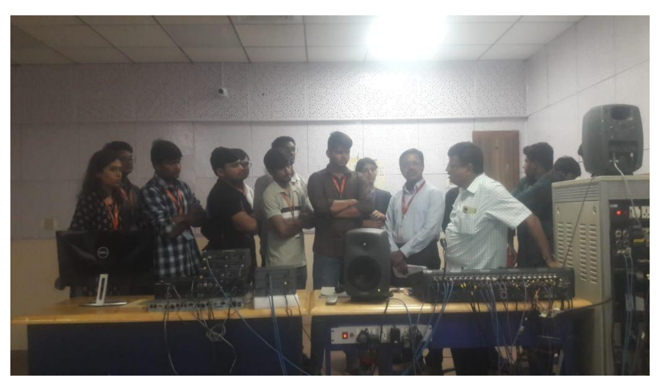
Discussing the doubts with the expert in Doordarshan Kendra