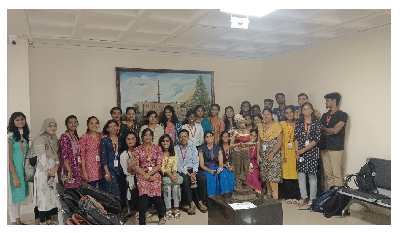
Group photo of all members at Doordarshan Kendra reception