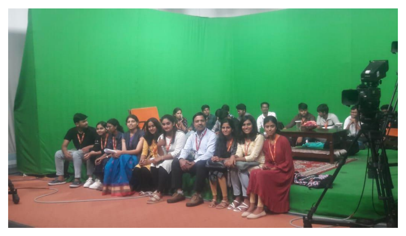
Live studio in Doordarshan Kendra