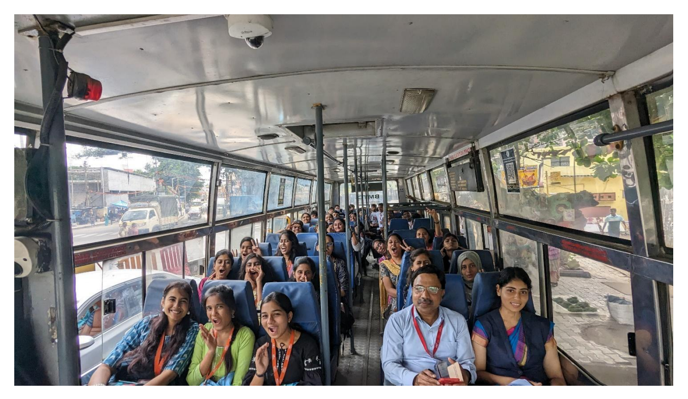
Group photo of all members in bus while returning from Doordarshan Kendra