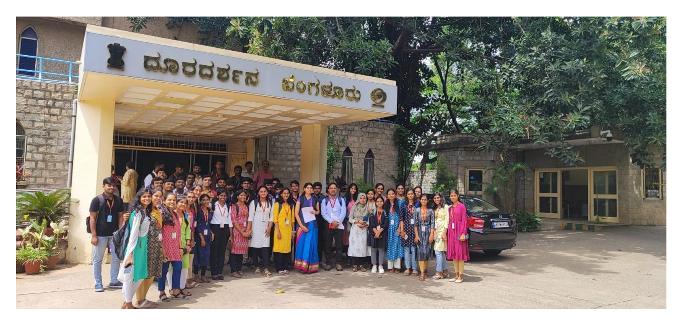
Group photo of all members at Doordarshan Kendra, J.C. Nagar, Bangaluru- 560 006