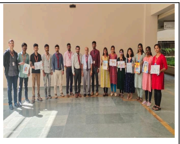
Sample pictures of the event