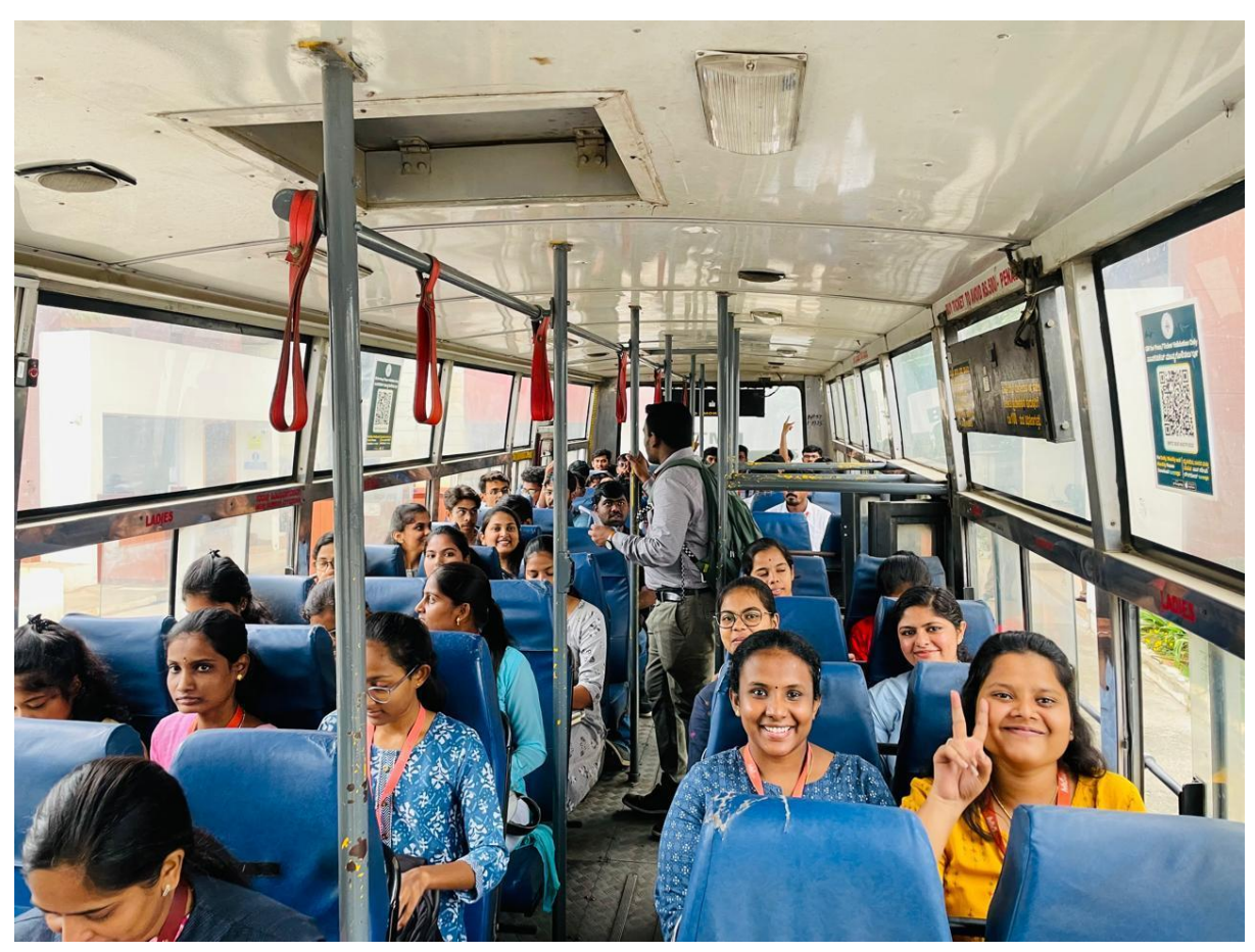
Group photo of all members in bus while starting from MVJCE