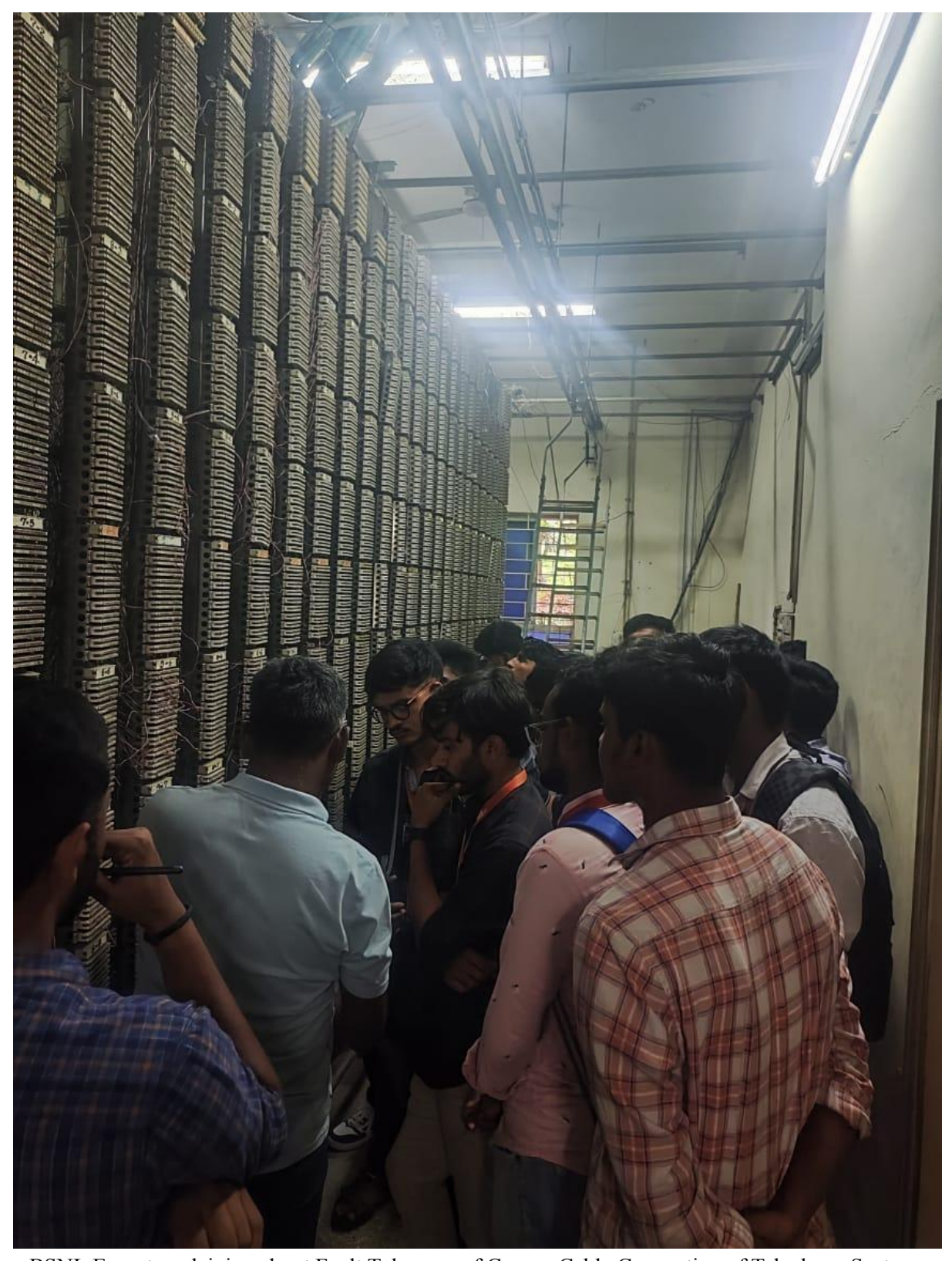
BSNL Expert explaining about Fault Tolerance of Copper Cable Connection of Telephone Systems