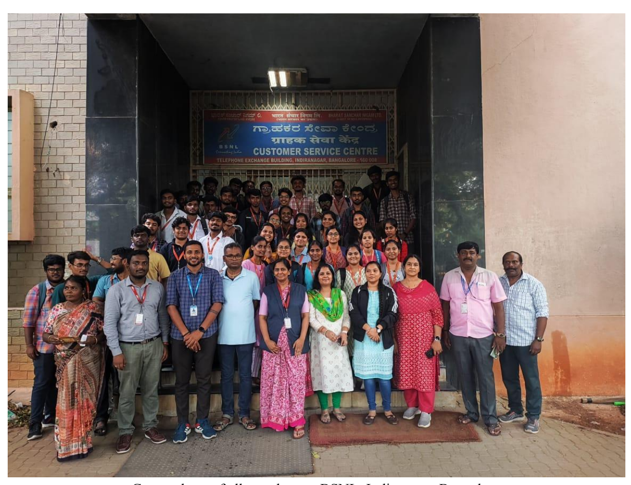
Group photo of all members at BSNL, Indiranagar Bangaluru