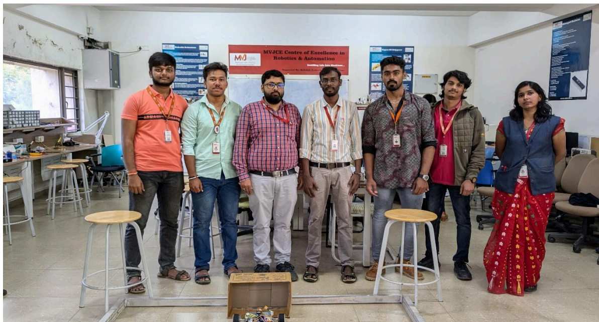
Runners up Team of the Robo Kabaddi/Soccer competition