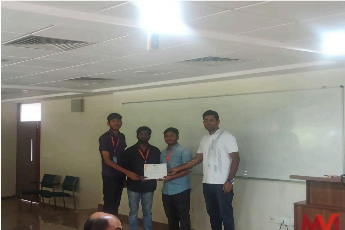
Winner Team of the Robo Kabaddi/Soccer competition getting certificate from chief guest

Affiliated to VTU, Belagavi, Approved by AICTE, New Delhi, Recognized by UGC with 2(f) & 12 (B), Accredited by NBA & NAAC