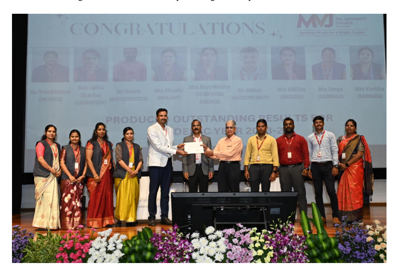
PU College Faculty Members awarded Letters of Appreciation

The results of our MVJ Pre University College students have also been outstanding in the recently concluded Pre University exams. Letters of Appreciation were presented to the faculty of MVJ PU College for their stellar role in producing these superlative results.