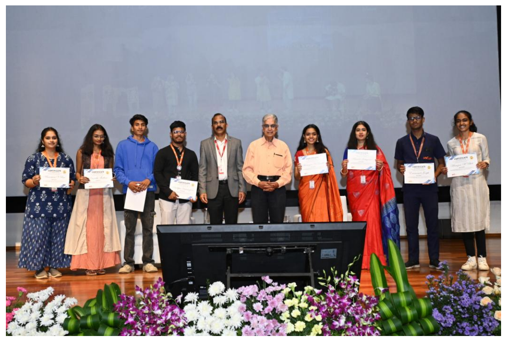
Award winners receiving the awards