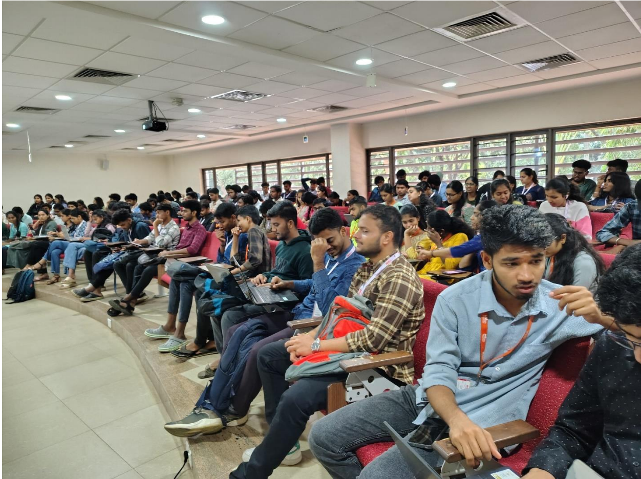
Fig 2: Students attending the club activity session at Seminar Hall 4 at 2 nd half