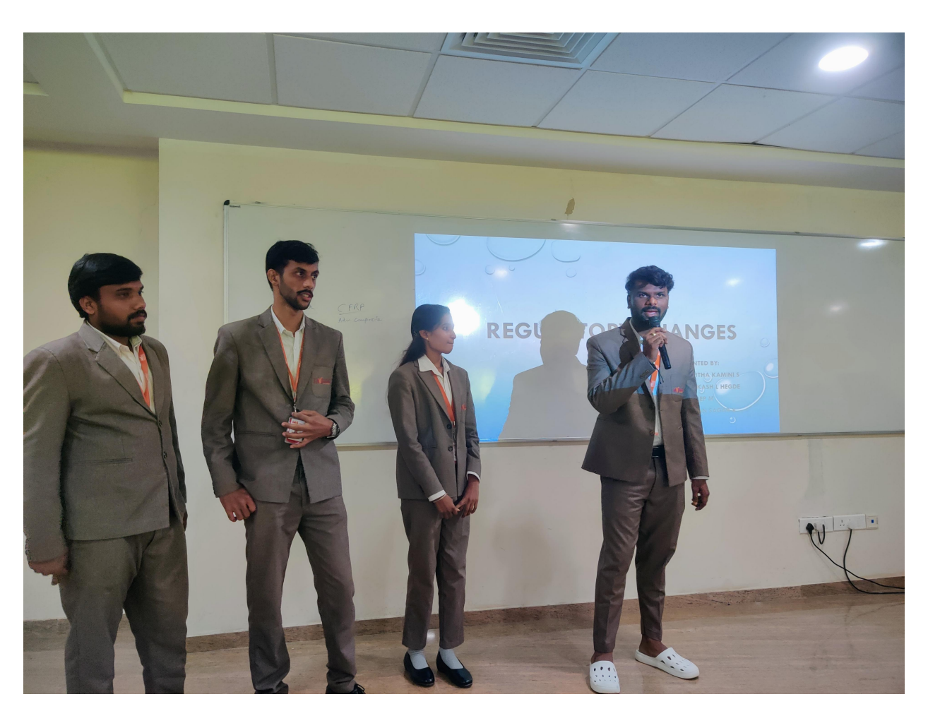
Team answering the queries asked by the judges.