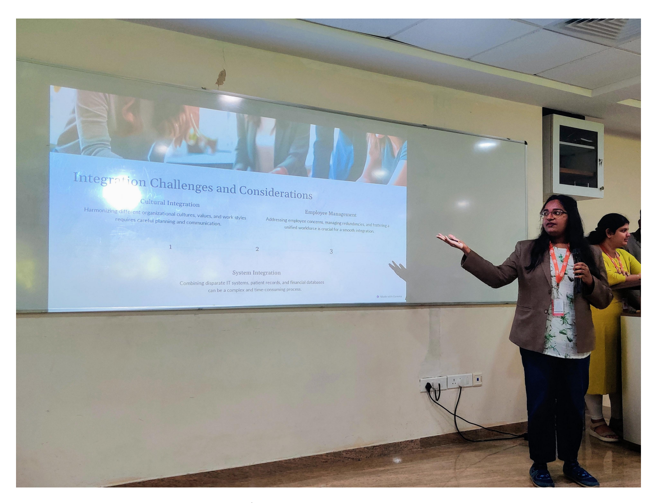
Student's Finsight Challenge Presentation