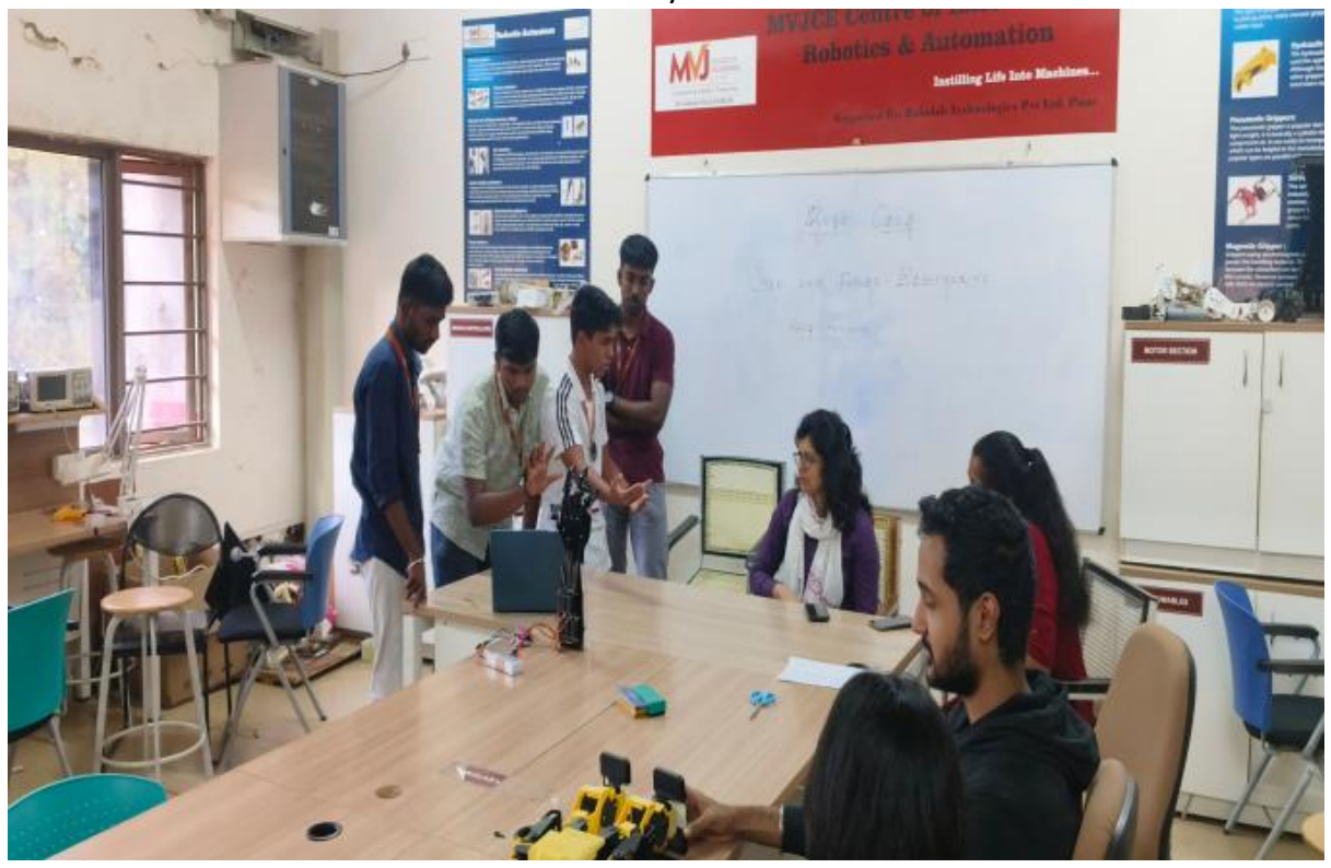
Participants explaining their Project in the competition