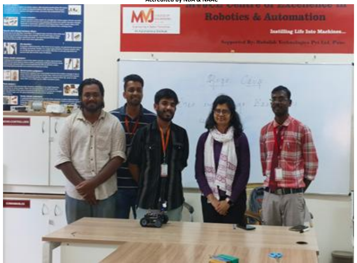
Runners-up Team of the competition getting certificate from the chief guest.