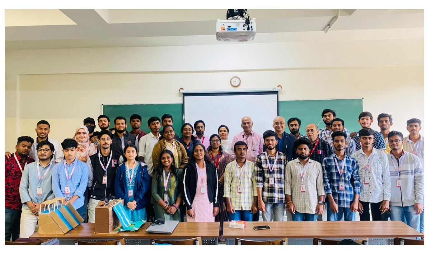
Participants from the Club Activity 'Dams and Spillways'