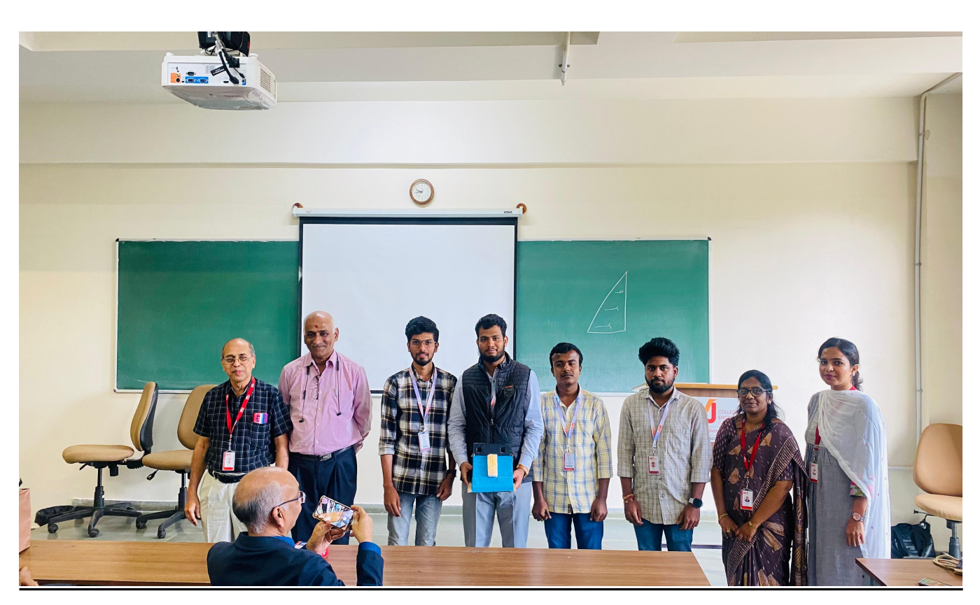
1st Prize Winners of the Club Activity 'Dams and Spillways'