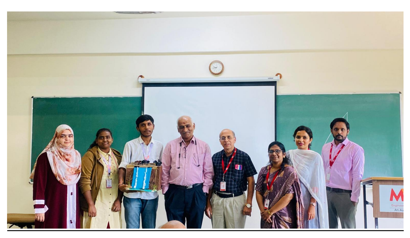
2<sup>nd</sup> Prize Winners of Club Activity 'Dams and Spillways'