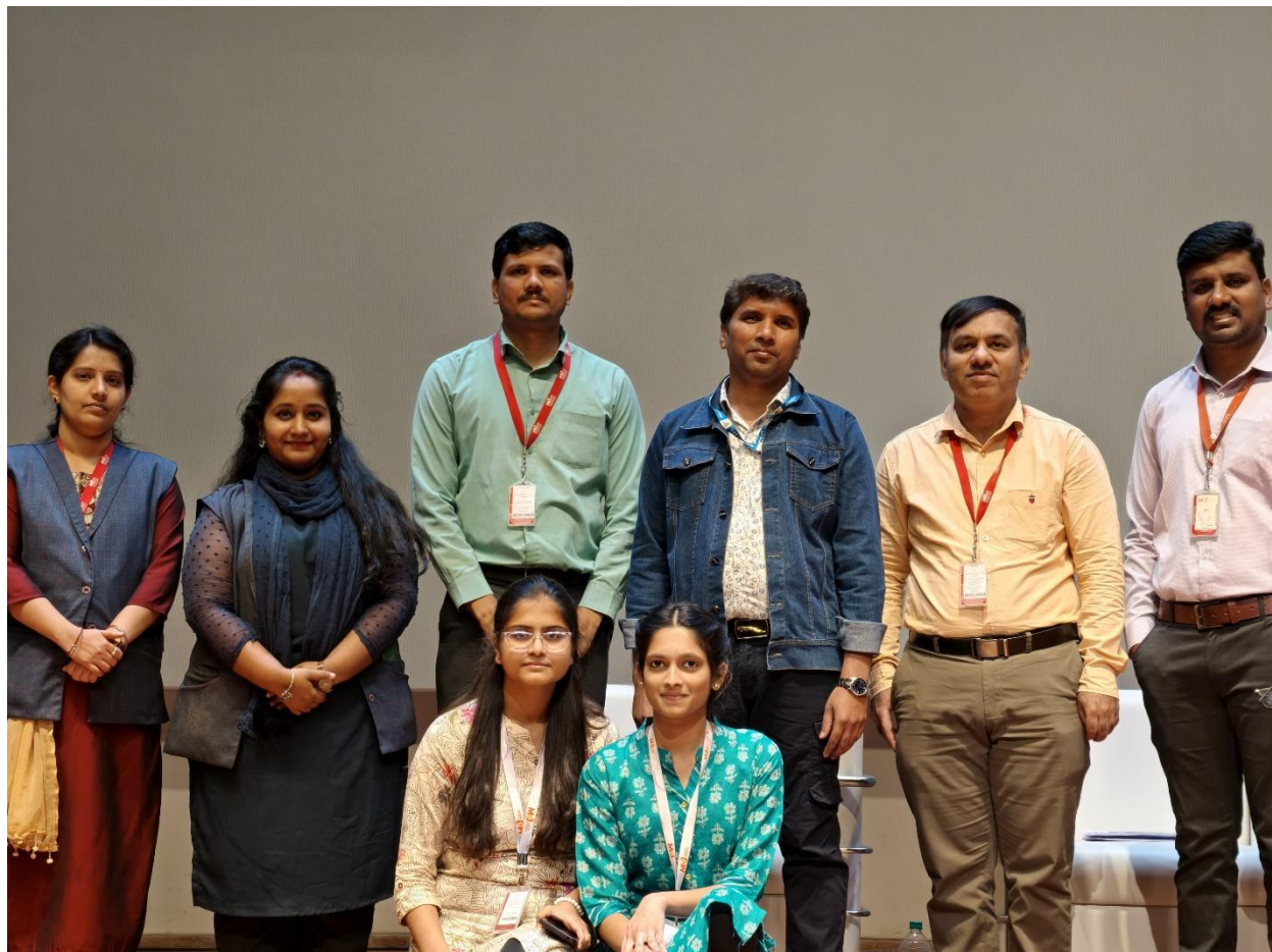
Faculties and the volunteers during the guest lecture.

MVJCE for having given this opportunity to conduct the Guest lecture. A special mention to ITHELPDESK and team for their technical support during the session.