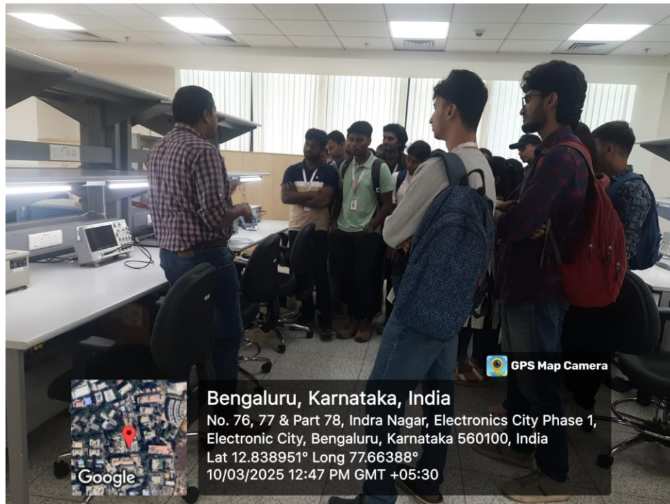
Figure 6: Lab equipment explained by members at STPI.