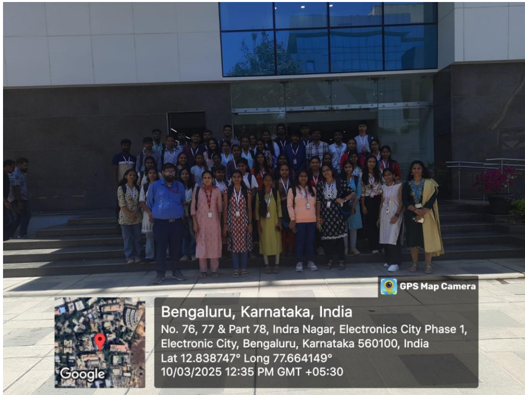
Figure 1: Our students with the members of STPI, Bengaluru.