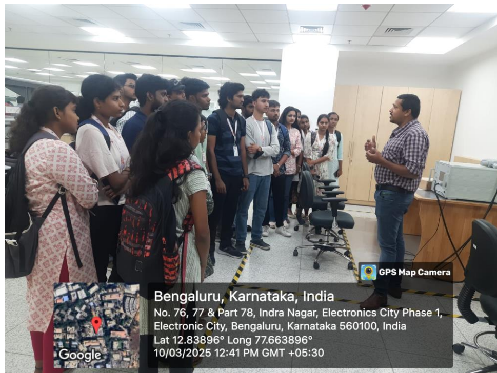
Figure 4: Lab equipment explained by members at STPI.