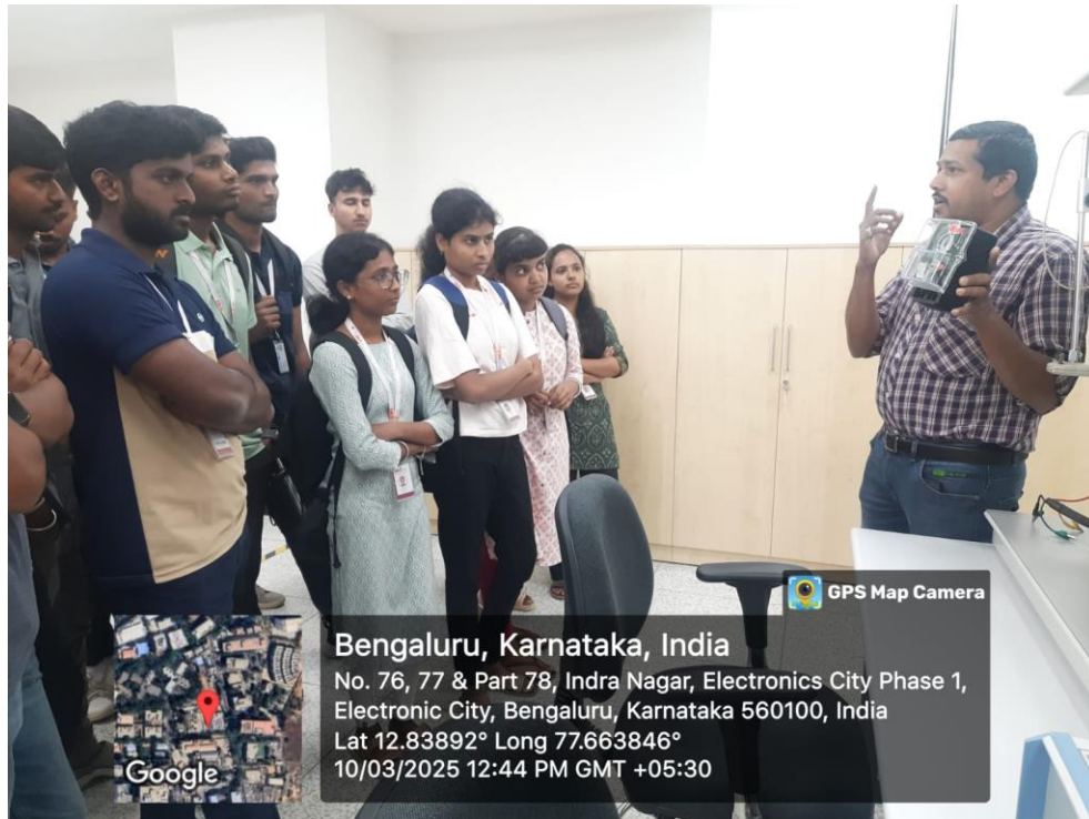
Figure 5: Lab equipment explained by members at STPI.