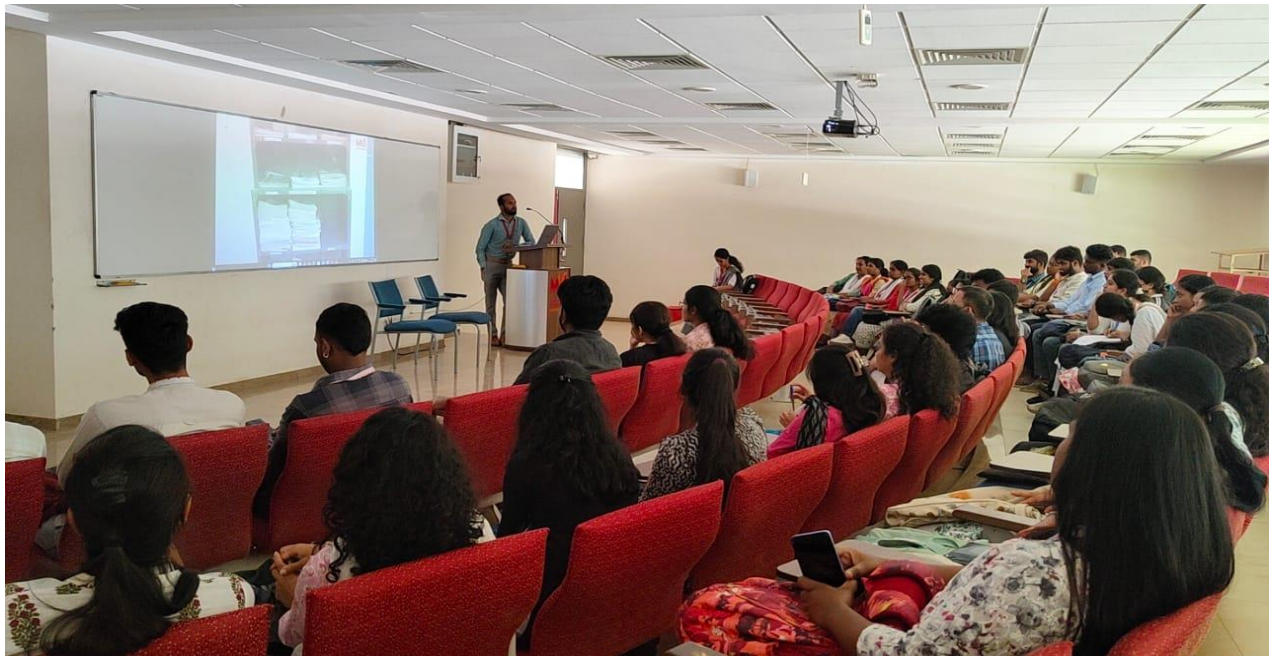
The Central Library MVJCE, conducted an orientation session: "Library Orientation Session – PG Batch 2024-2025" held on 08/03/2025 at 12.30 p.m.