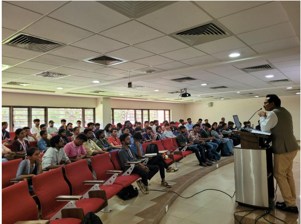
The speaker interacts with students