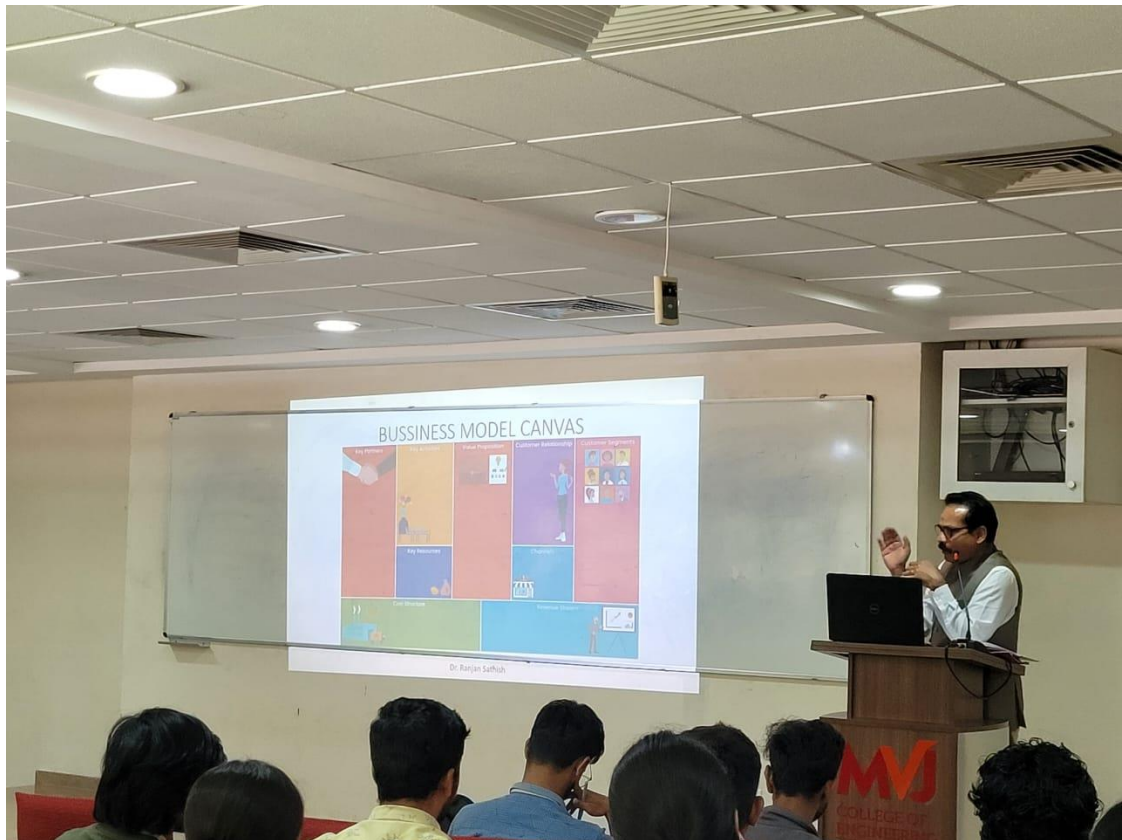
Lecture by the speaker