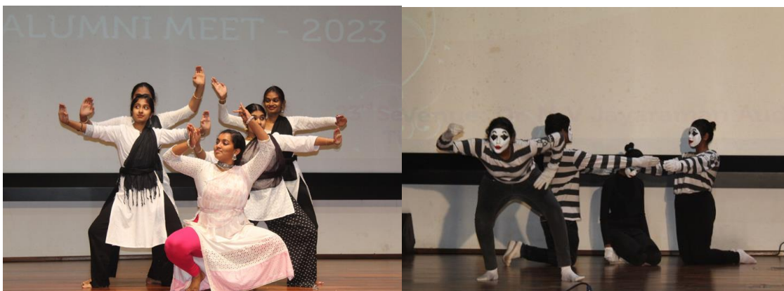
(Left) Dance Performance by Nithyatrix Dance Club; (Right) Mime performance by Team Raaghabhinaya

Following this, Team Raaghabhinaya, the Theater and Production Club of MVJCE, captivated the audience with a thought-provoking mime presentation. Then, MADMONKS, the college's dance team, took the stage, delivering an exhilarating performance that electrified the atmosphere.