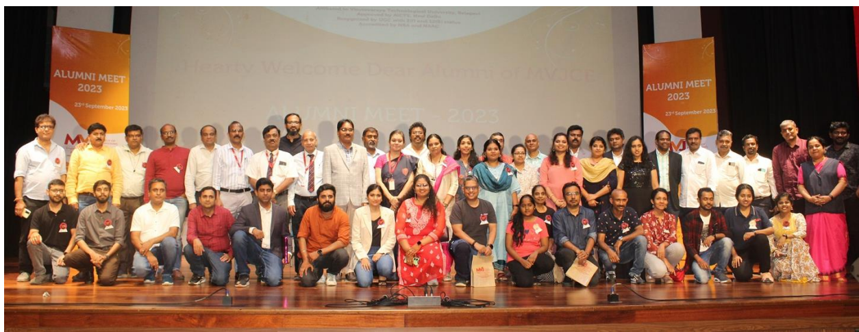
Alumni Meet-2023 Participants Captured in a Group Photograph