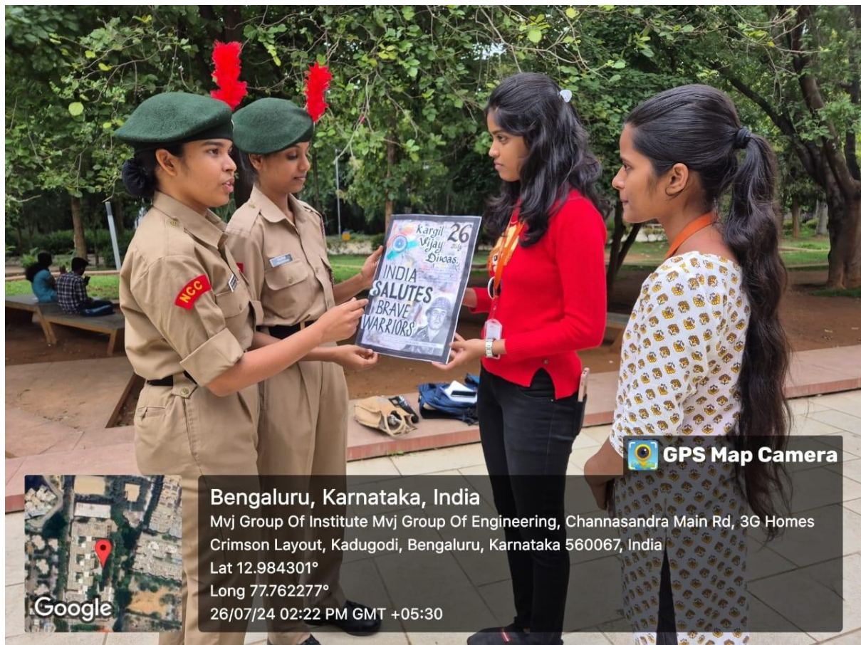
Campus Awareness by NCC Cadets