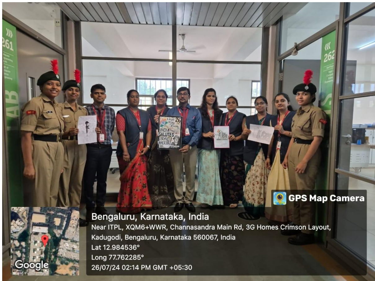
Campus Awareness by NCC Cadets