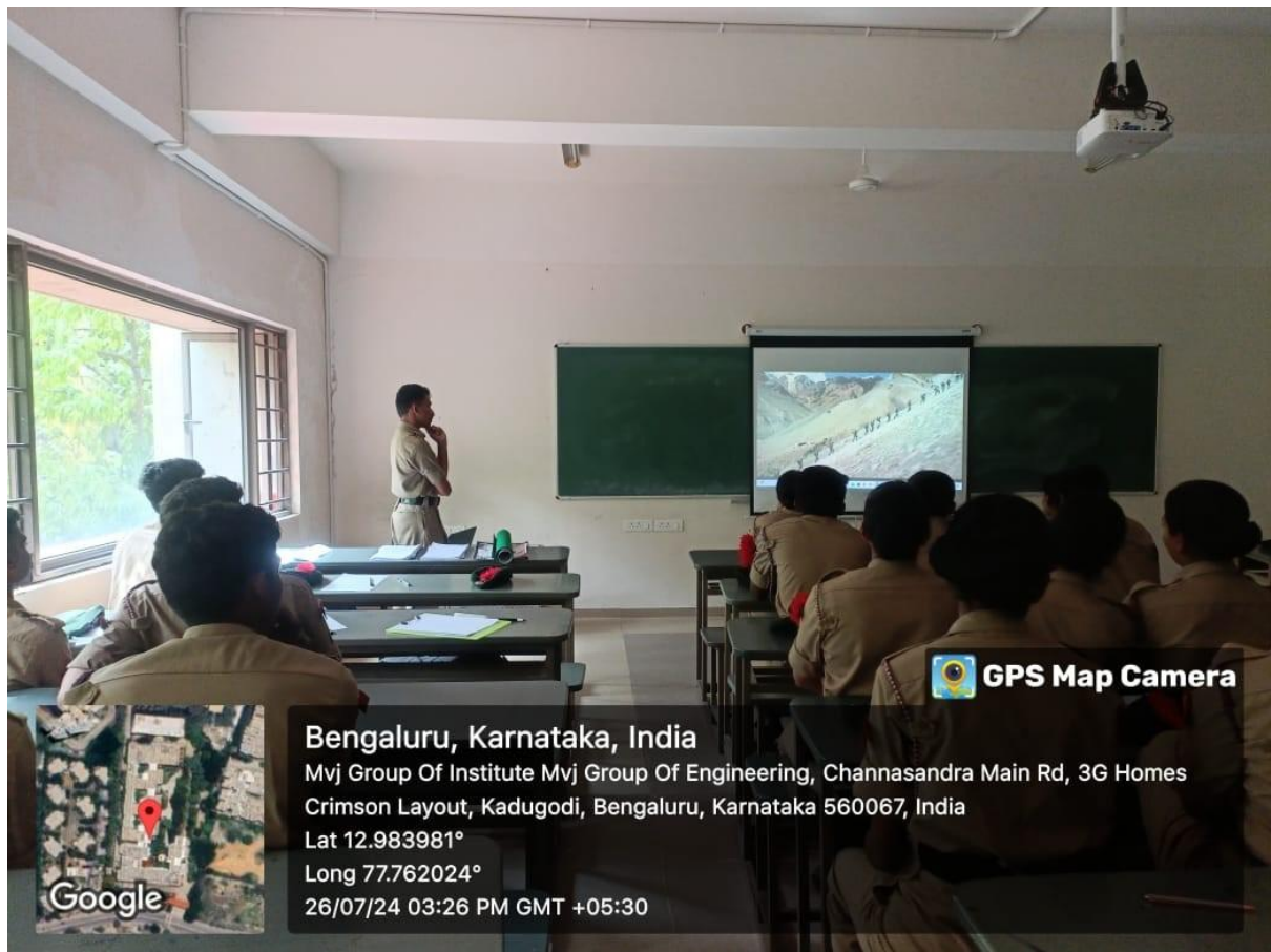
Documentary Video screening