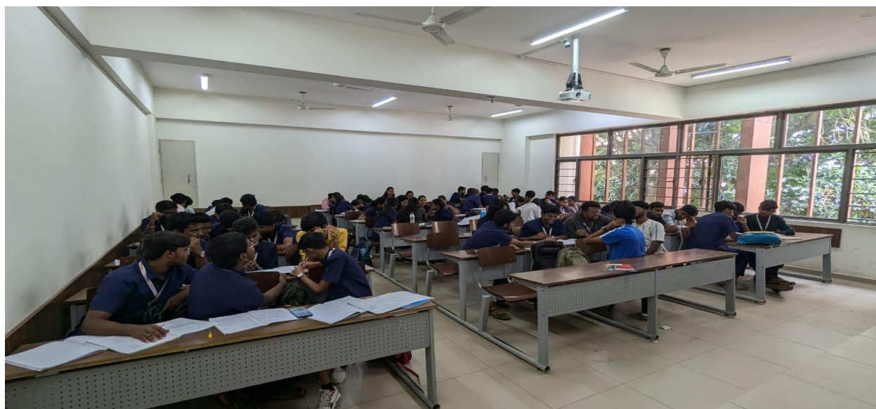
Fig 1: Students found the event very interesting and beneficial, and actively took part in this activity (First round).

The Department of Physics organised a club event titled “Physics puzzle solving competition” on May 27 th , 2025. The event commenced at 1:00 PM and concluded at approximately 4:00 PM, consisting of two rounds of competition. The first round of puzzle-solving occurred from 1:00 PM to 2:30 PM across various rooms (210, 212, 213, 215, 216, and 217), with around 80 groups participating. From these, 6 groups were selected to advance to the second round, which took place from 2:45 PM to 3:15 PM in room 222, attended by guest Dr. Prosenjit Ghosh. The event concluded with a prize distribution ceremony, where the shortlisted 6 groups competed for awards. The first prize of Rs. 1000 was awarded to Janani K S, Devayani M, Preethi, Ankitha, Sushumna M R, Sangeetha S; the second prize of Rs. 500 went to Pavanashree B S, Sanjana S, Pratheeksha, O N Anusha, Rekha, Meghana; and the third prize winners received certificates. Additionally, participation certificates were issued to the remaining 3 groups, totalling 8 participants.