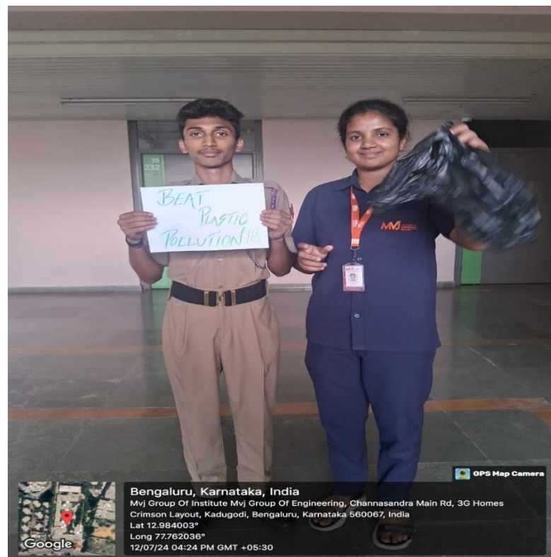
Students participating in World paper bag day activity