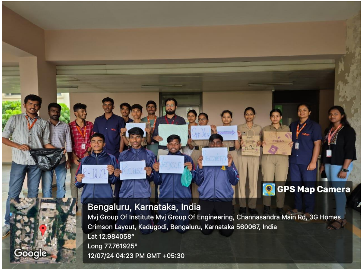
Group photo of students participating in World paper bag day activity