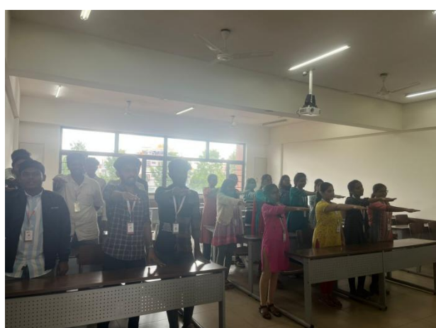
Students taking pledge on Swachh Bharat Abhiyaan Under EBSB from various departments

The event was further enriched by its association with the Ek Bharat Shreshth Bharat initiative, which encourages students to appreciate and celebrate India's cultural diversity. During the activity, students engaged in meaningful exchanges of ideas and perspectives, blending regional values and strengths in line with the EBSB vision.