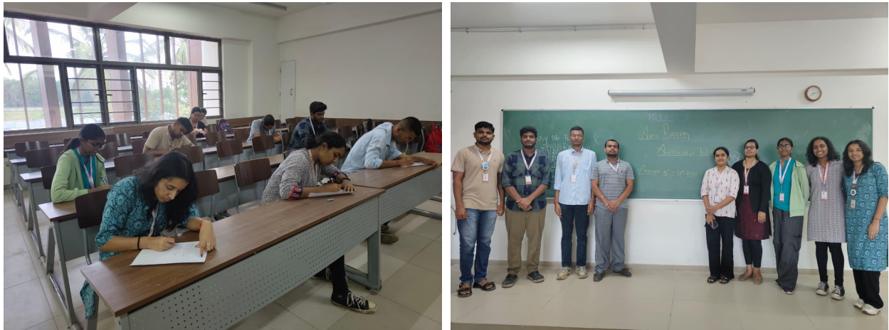
Fig. 2: Students participated in the poetry and essay competition