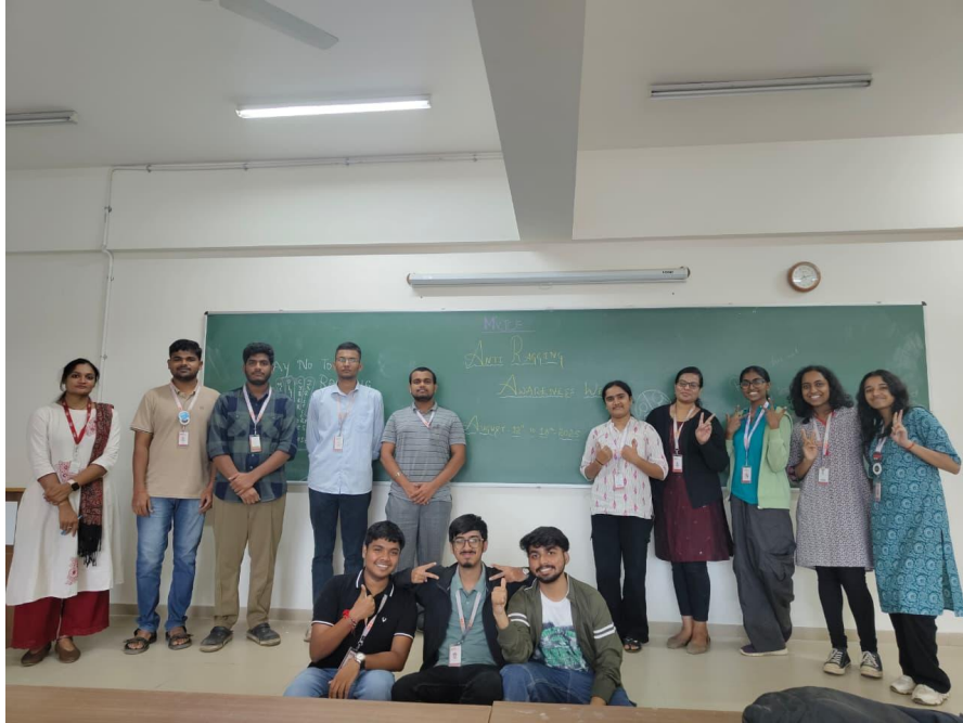
Fig. 3: Anti-Ragging Team Members