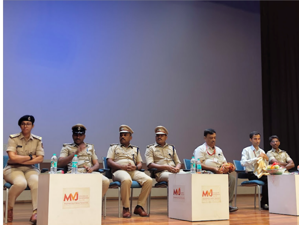
Figure 1: All dignitaries on the Dias

An Autonomous Institute Approved by AICTE, New Delhi Affiliated to VTU, Belagavi Recognized by UGC under 2(f) & 12(B) Accredited by NBA & NAAC