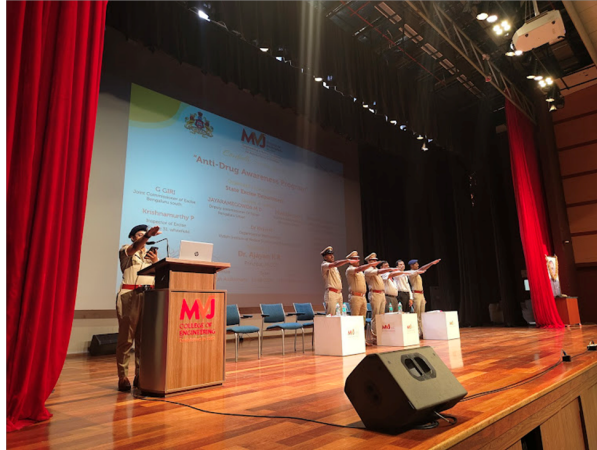
Figure 4: Dignitaries are pledging to the drug awareness State Excise Department honoured the dignitaries on the dias by felicitating with a shawl, a garland & fruit bowl as a token of appreciation for supporting the event

An Autonomous Institute Approved by AICTE, New Delhi Affiliated to VTU, Belagavi Recognized by UGC under 2(f) & 12(B) Accredited by NBA & NAAC