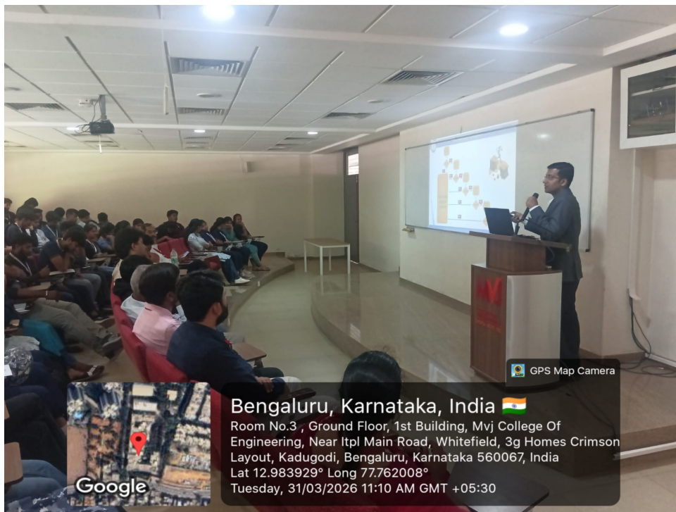
Figure 2: Speaker delivering lecture on Aircraft Propulsion Systems

An Autonomous Institute Approved by AICTE, New Delhi Affiliated to VTU, Belagavi Recognized by UGC under 2(f) & 12(B) Accredited by NBA & NAAC