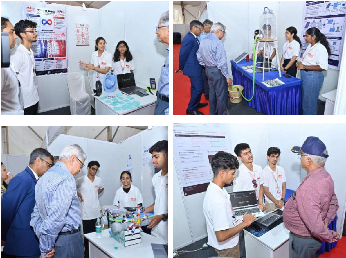
Fig. 18. Students explaining their projects in the project stalls to all the dignitaries