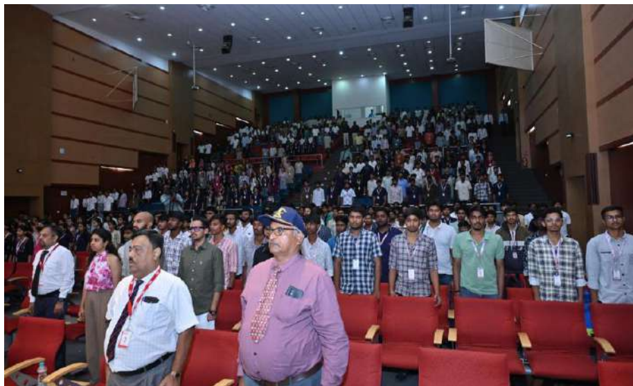
Fig. 28. All dignitaries and participants standing during the National Anthem at the conclusion of Project Expo 2026

The event concluded with the solemn rendition of the National Anthem, with all participants rising in respect, marking a dignified and patriotic closure to Project Expo 2026.