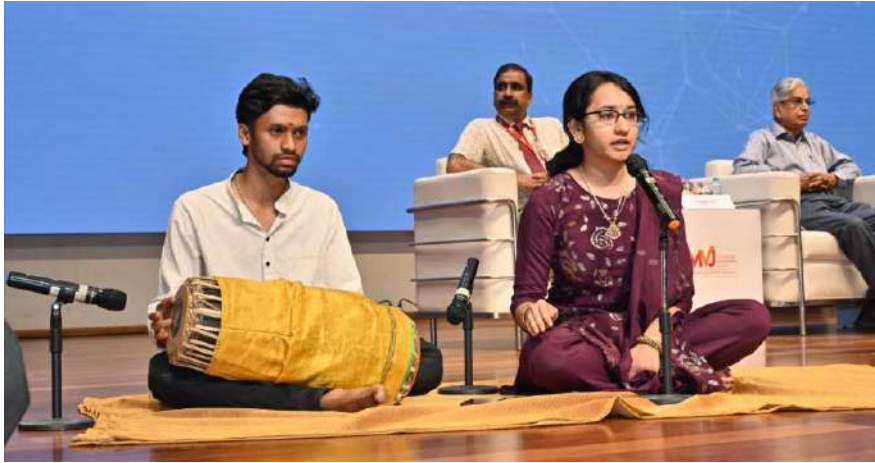
Fig. 1. Invocation Song by students

This was followed by the traditional lighting of the lamp by the dignitaries, symbolizing the dispelling of ignorance and the spread of knowledge.