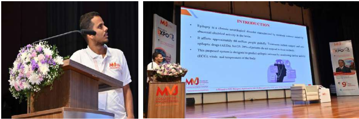
Fig. 23. Students from Electrical Stream presenting their project titled “Epilepsy Detection using Embedded Systems and Machine Learning”