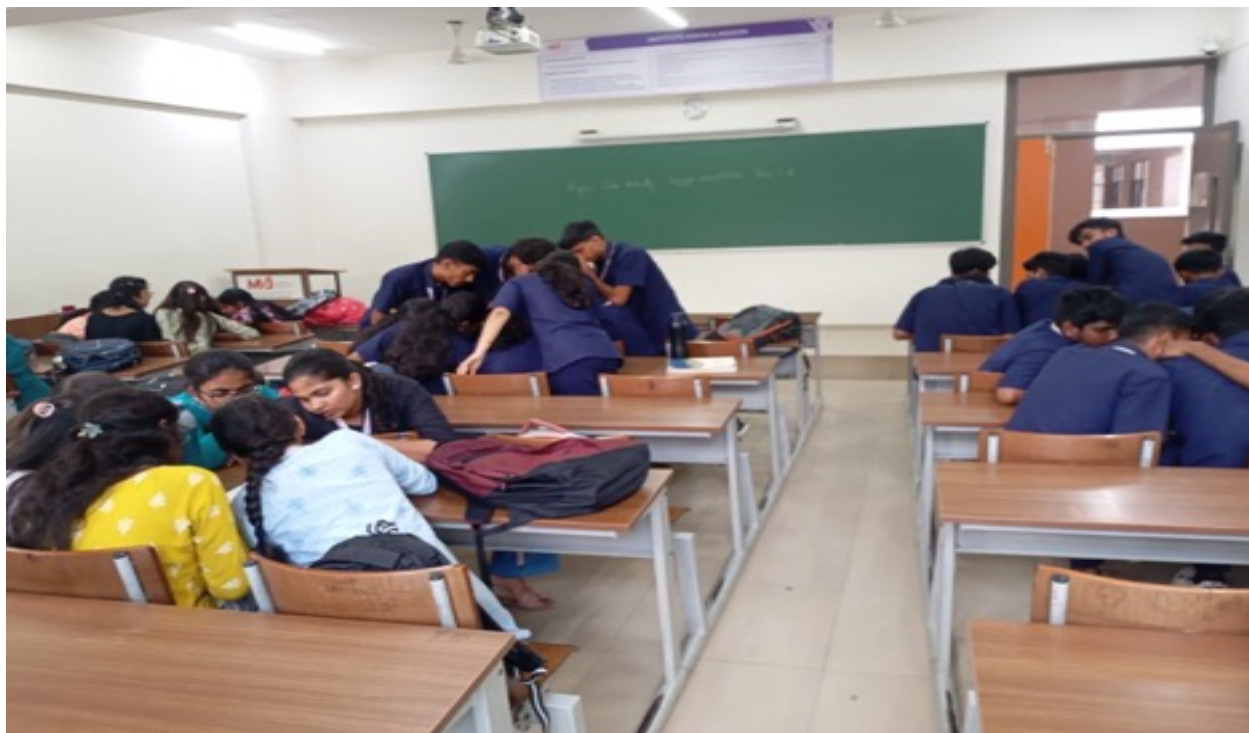
Fig. Students solving the quiz in round one in their respective classes.

The Department of Physics organised a Physics Quiz Competition for first-year 2 nd Sem students to foster interest in physics and encourage scientific curiosity. The competition was structured in two rounds. The first round was held in the respective classrooms, with around 300 students participating enthusiastically. The highest scorers from each class were shortlisted for the second round. The second round was conducted on the 30 th of May 2026 from 1:00 pm to 3:30 pm with around 20 students.