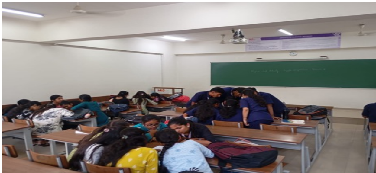
Fig. Students solving the quiz in round one in their respective classes.

active participation and created an atmosphere of healthy competition, allowing students to demonstrate their knowledge of fundamental physics concepts.